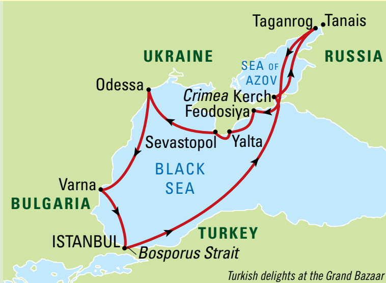
Turkish delights at the Grand Bazaar