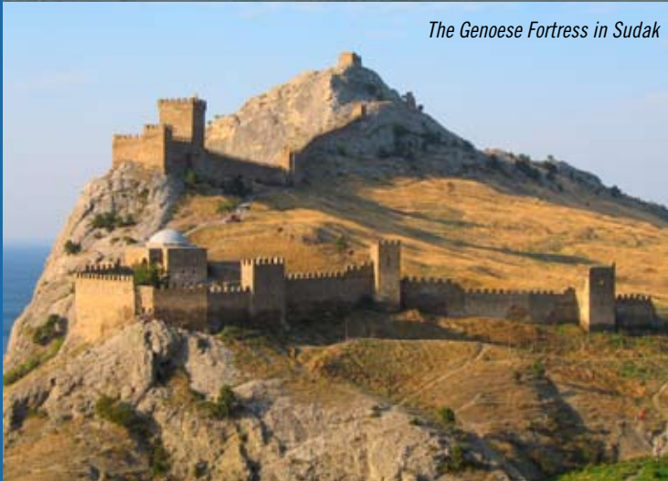
The Genoese Fortress in Sudak