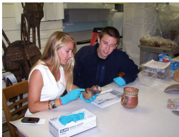
Figure 4. After searching the Online Artifact Database, students from "Conversation," a Spanish class at Wake Forest University, work with objects and paper copies of database records in the Museum of Anthropology's curation room.

Museum staff members have presented at state, regional, national, and international conferences during the past year and one article has been published in the Proceedings of DigCCurr 2009: Digital Curation Practice, Promise and Prospects . By the end of October 2009, we directly introduced the database to approximately 1,336 K–12 educators, 203 university faculty and staff members, and 138 conference atten-