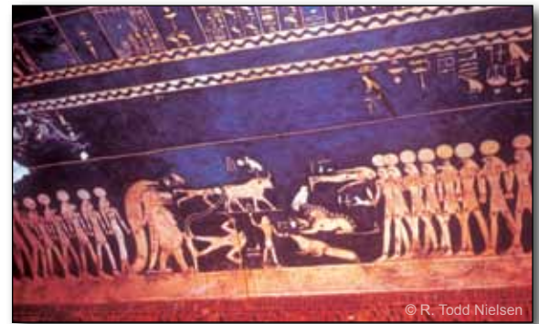
(Above) The Tomb of Seti I, which you will visit on Mar. 16 th , is the most complex tomb ever built in the Valley of the Kings.

In the Valley of the Kings, our morning exploration includes several amazing royal tombs, including the legendary Tomb of Tutankhamen and the spectacular Tomb of Seti I. After lunch, visit the stunning mortuary temple of Hatshepsut at Deir el Bahari, including the Third Terrace Sanctuary of Amun (closed to the public) with its beautifully preserved painted decoration and gilded decoration from Ptolemaic times. Return to our hotel on the east bank of the Nile, and gather this evening for dinner. (B,L,D)