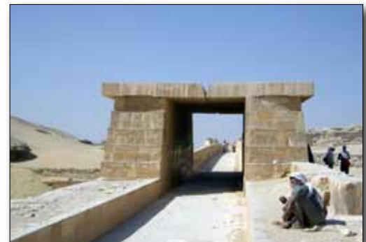
(Top) The Step Pyramid of Djoser, Saqqara. (Above) The Causeway of Unas, Saqqara. (Below) The Sphinx and the pyramids at Giza.