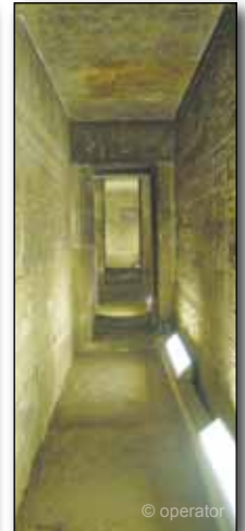
Visit the less frequented yet magnificent temples at Abydos (above left), where your lecturer has been doing fieldwork since 1993, and Dendara (above right). Below: An image from within the Tomb of Nefertari, which you will visit on Mar. 17 th .