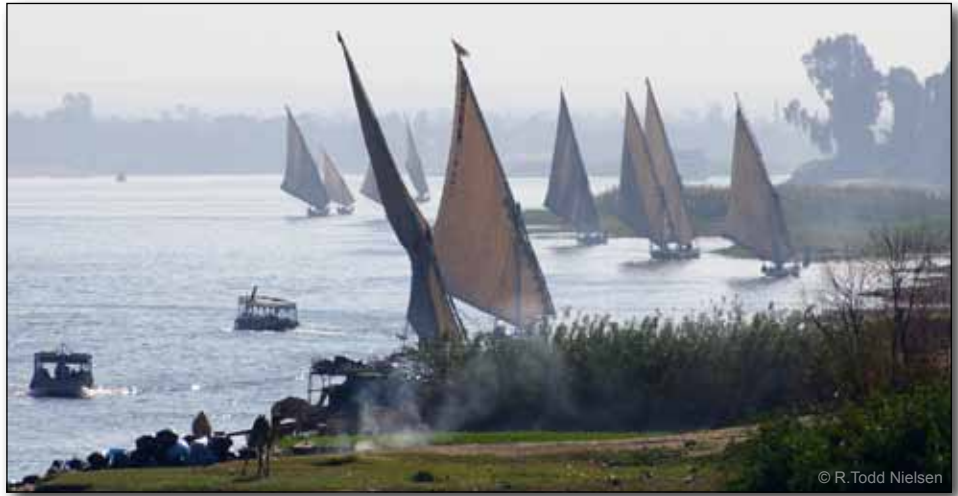
(Top) The magnificent Temple of Isis at Philae. (Above) Feluccas seen along the banks of the Nile. (Below) Abu Simbel, whose two temples were commissioned by Pharaoh Ramses II in the 13 th century B.C.