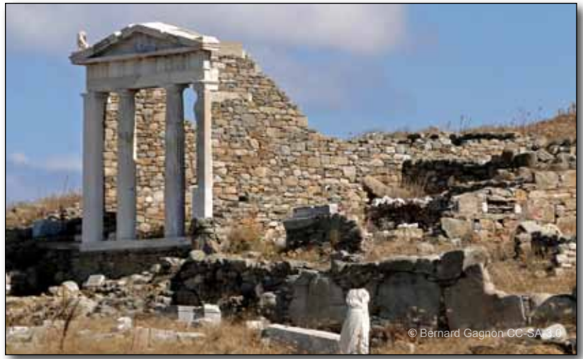
Above, the Temple of Isis on Delos. Below (1), the Library of Celsus at Ephesus, Turkey. Below (2), a seafood restaurant on Naxos, Greece. Bottom, our 26-cabin ship docked at Patmos, Greece.

Rugged, volcanic Patmos is most notable as the place where one of the twelve apostles, St. John the Evangelist, is said to have received his vision of fire and brimstone and dictated the Book of Revelation. This morning we visit the Monastery of St. John and the Holy Cave of the Apocalypse, a UNESCO World Heritage site, to see where the holy man lived and worked, followed by a short walk through Patmos Town. After lunch onboard, enjoy free time to stroll around the quaint harbor town of Skala before returning to the ship for dinner. Late this evening we begin cruising toward Santorini. (B,L,D)