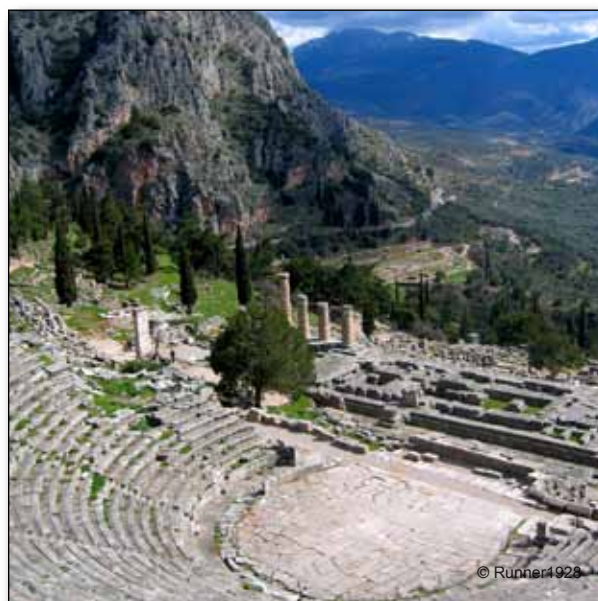
Above, the theater at Delphi, site of the ancient Greeks' most important oracle. Below, one of the many medieval monasteries built atop the pinnacles of Meteora.

Perched precariously atop towering rock columns, the Meteora ("rocks in the air") monasteries are truly awe-inspiring and a UNESCO World Heritage site. Tenth-century ascetics sought peace in the many caves, and the first monastery was built in 1336. A winding road provides access to several in their splendid isolation; examine their paintings, carvings, and icons. Have lunch on your own, then discover a Byzantine tradition during a visit to a nearby icon-painting workshop. This evening, a local Greek family will host us for dinner at their home. (B,D)