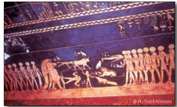
(Above) The Tomb of Seti I, which you will visit on Feb. 23 rd , is the most complex tomb ever built in the Valley of the Kings.

In the Valley of the Kings, our morning exploration includes several amazing royal tombs, including the legendary Tomb of Tutankhamen and the spectacular Tomb of Seti I. After lunch, visit the stunning mortuary temple of Hatshepsut at Deir el Bahari, including the Third Terrace Sanctuary of Amun (closed to the public) with its beautifully preserved painted decoration and gilded decoration from Ptolemaic times. Return to our hotel on the east bank of the Nile, and gather this evening for dinner. (B,L,D)