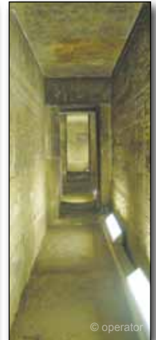
Visit the less frequented yet magnificent temples at Abydos (above left), where your lecturer has been doing fieldwork since 1993, and Dendara (above right). Below: An image from within the Tomb of Nefertari, which you will visit on Feb. 24 th .