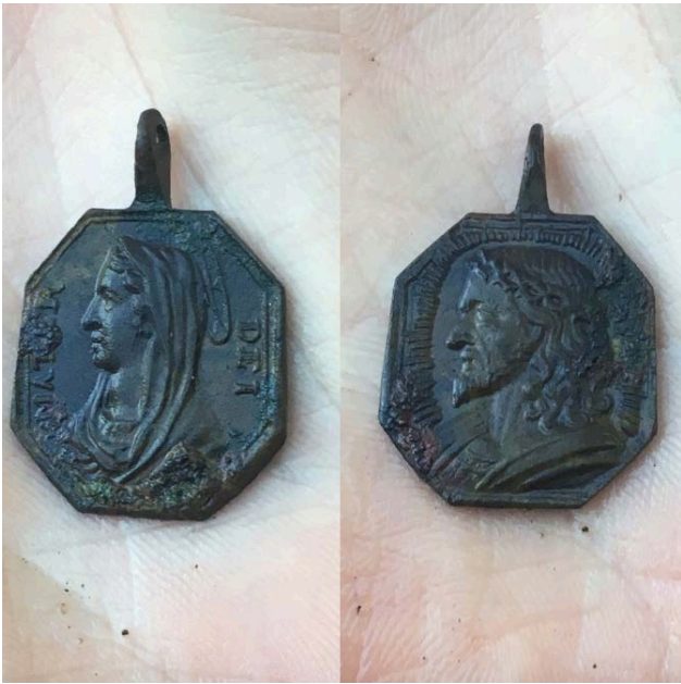
The photograph on the left is of the religious medallion that we found. The bottom left was taken at the open house while I helped with a children's activity and the bottom right shows me excavating next to Feature 26.