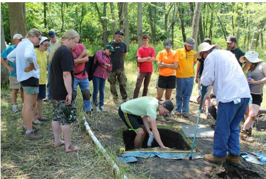
The photograph below was taken during our daily pit tours after lunch. The photo to the right is of a fellow student wet screening.