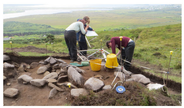
Three workers at the Achill Island Field School examine an enclosure wall.

The AIA received over 250 archaeology-themed photos taken in more than 30 different countries for its fourth annual Photo Contest. More than 11,000 votes were cast in one week in support of the various entries.