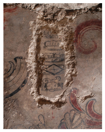
A mural with glyphs at San Bartolo, photo courtesy Heather Hurst.

The Alliance for Heritage Conservation received a grant in support of its conservation and education program focused on the remains of a 17th century church in the community of Tahcabo in northern Yucatan. Occupation at Tahcabo, a small Yucatec-Maya village of around 500 people, can be traced back to approximately 400 BC. The arrival of the Spanish in the 16th century brought Christianity to the region. The remains of the church include a