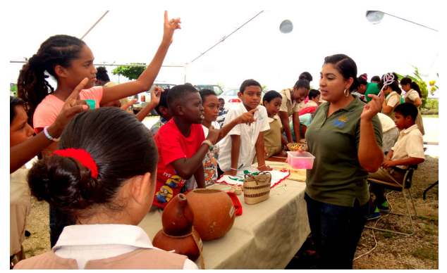
A presenter from the Institute for Social and Cultural Research explains traditional activities still practiced by present-day Maya communities at an International Archaeology Day fair at the Belize Institute of Archaeology.

The Lecture Program, as always, offered opportunities for Societies and the general public to learn about the latest archaeological discoveries. This past year, there were 219 lectures given by 86 lecturers to an average audience size of 92.