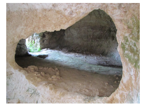
The interior of an Aidonia tomb.

The site of Aidonia includes several Late Bronze Age cemeteries dating from the 15th to 13th centuries B.C.E., many of which were looted in the 1970s. The TAPHOS project is designing and implementing a plan to physically secure the site, while increasing awareness about the material destruction and knowledge loss caused by looting. The grant will help fund a visitor's center with exhibit and teaching spaces, the design of materials, staff training, and the establishment of proper pathways and signage throughout the site.