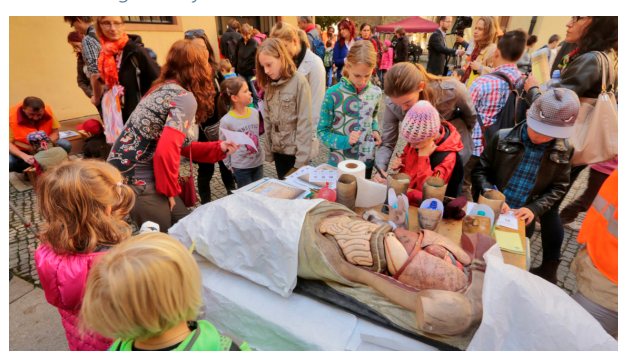
The Czech Institute of Egyptology at Charles University in Prague welcomed 1,000 visitors to its archaeology fair and accompanying lecture and film screening.