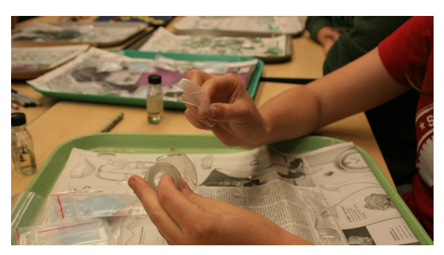
Workers reassemble a bottle uncovered at Johnson's Island. Reconstructing objects helps archaeologists understand their manufacture and function.

Photos from the contest are featured in the AIA calendar "A Year of Archaeology." Proceeds from calendar sales support the Site Preservation Program.