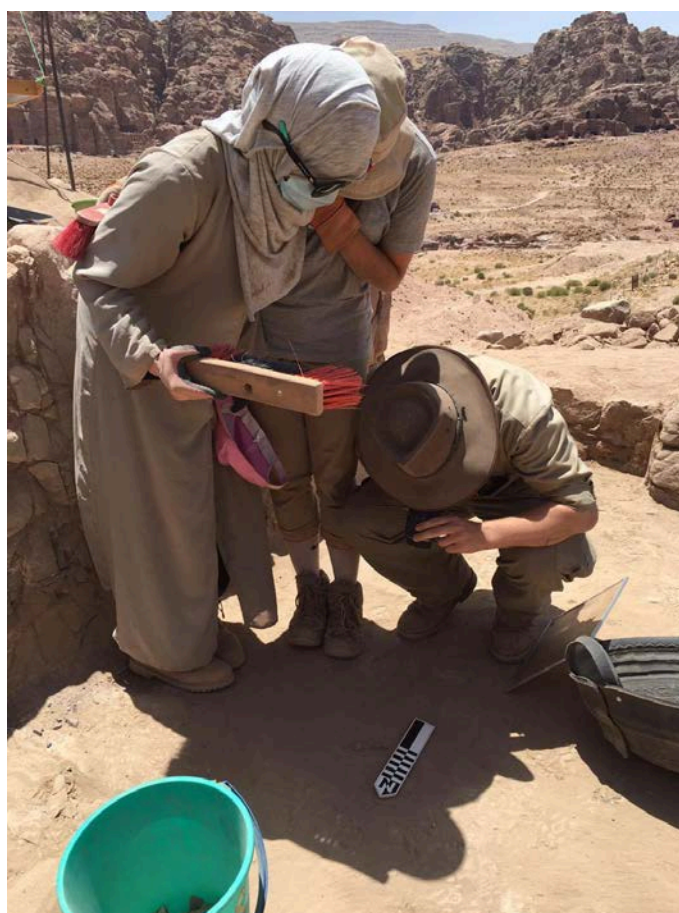
Fig 3. Me and my fellow trench-mate are huddling close together in order to cast a shadow on an artifact so that the area supervisor can take a higher quality image so that the sun's light does not distort the colors of the image. (right)