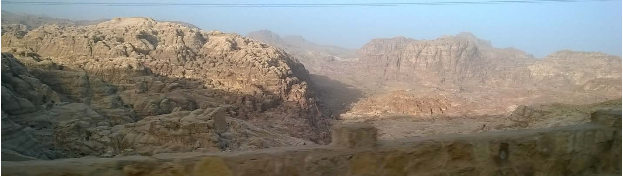
Fig 6. Just a beautiful view I experienced everyday on my commute to the dig site.