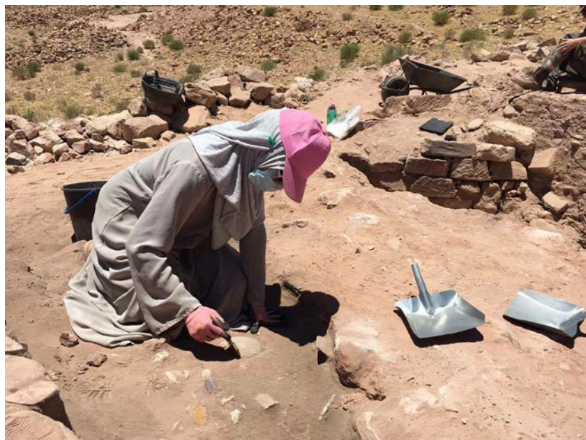
Fig 2. Here I am excavating a cooking vessel in an ash locus.