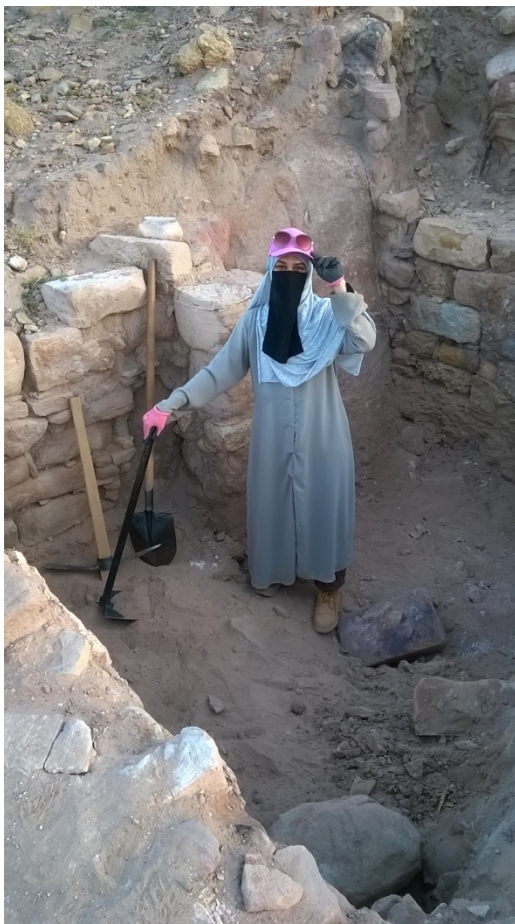
Fig 1. First day of the dig! Here I am removing backfill from C1 that the 2014 PNRP staff.

of the staff I survived 40 days in the desert and loved it! The project was well organized and because many of the staff members were members of ACOR's board we received lectures from other project directors that were conducting excavations in Petra in the same dig season. Not only was this dig school beneficial to my future academic career but it also gave me a cultural and language immersion experience by living with my Bedouin host family. I could never have asked for a more perfect first dig and life changing experience, which I would have never been able to experience without the help of the Archaeological Institute of America's support through the Jane Waldbaum Archaeological Field School Scholarship.