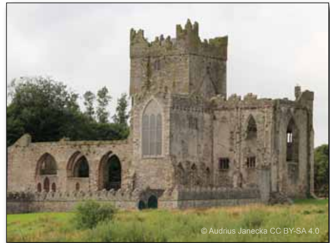
Above, the ruins of the Tintern Abbey, founded ca. 1200 by William, the Earl Marshall. Below, St. Mullin's Monastery & Fort, founded in the 7 th century.