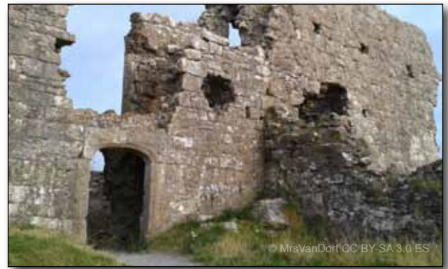
Above, the Rock of Dunamace, originally settled in the 9 th century. Below, the ruins of the monastery at Glendalough. Bottom, the Giant's Causeway, a UNESCO World Heritage site that consists of 40,000 basalt polygonal columns.