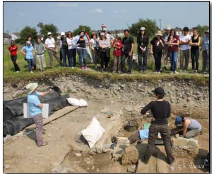
Above and below, ongoing excavation at the Blackfriary Community Heritage and Archaeology Project, supported by the AIA's Site Preservation Program. Bottom, a panoramic view of Knowth.