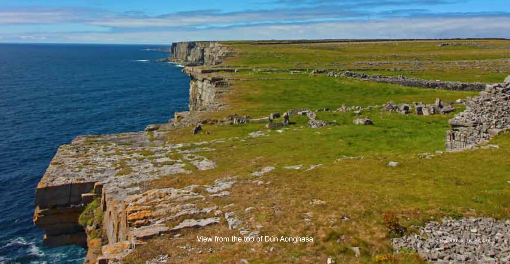
View from the top of Dún Aonghasa