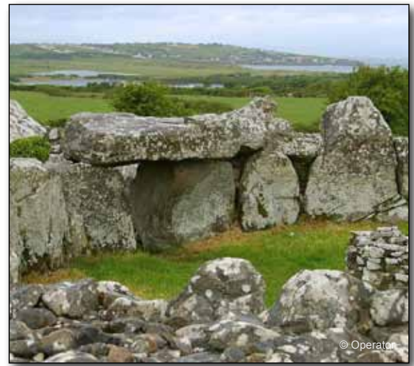
Above, the Neolithic tomb at Creevykeel. Below, the stone fort of Grianan of Aileach. Bottom, AIA travelers overlook Derry, Northern Ireland.

Transfer as a group to Dublin Airport (DUB) for return flights home. (B)