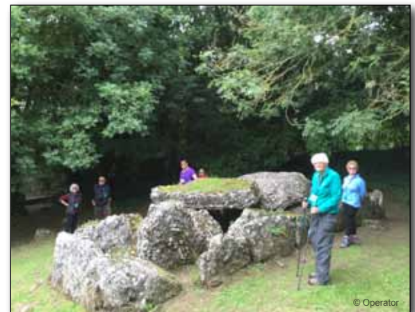
Above, AIA travelers visiting a wedge tomb at Lough Gur. Below, Reask Monastic site, Dingle Peninsula.