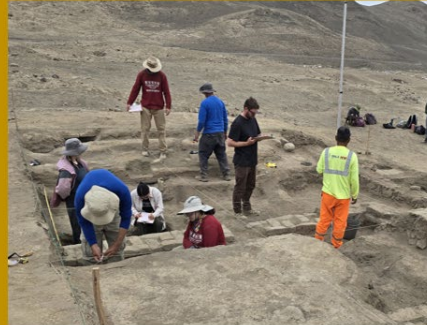
Fieldwork at Platform 1