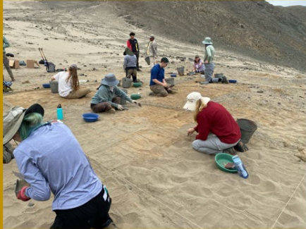
Fieldwork at CuzCuz

El Campanario project for the summer of 2026 will be organized in two separate sessions. The bioarchaeology session (June 15 th to July 17 th ) will continue excavating at the pre-Hispanic cemetery of Cuzcuz, where previous excavations identified burial contexts. The archaeology session (July 20 th to August 21 st ) will continue the excavation of Platform 1, a mud-brick structure containing painted walls and plastered floors where the local elite conducted public events.