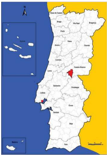
Location of the municipality of Proença-a-Nova on mainland Portugal.