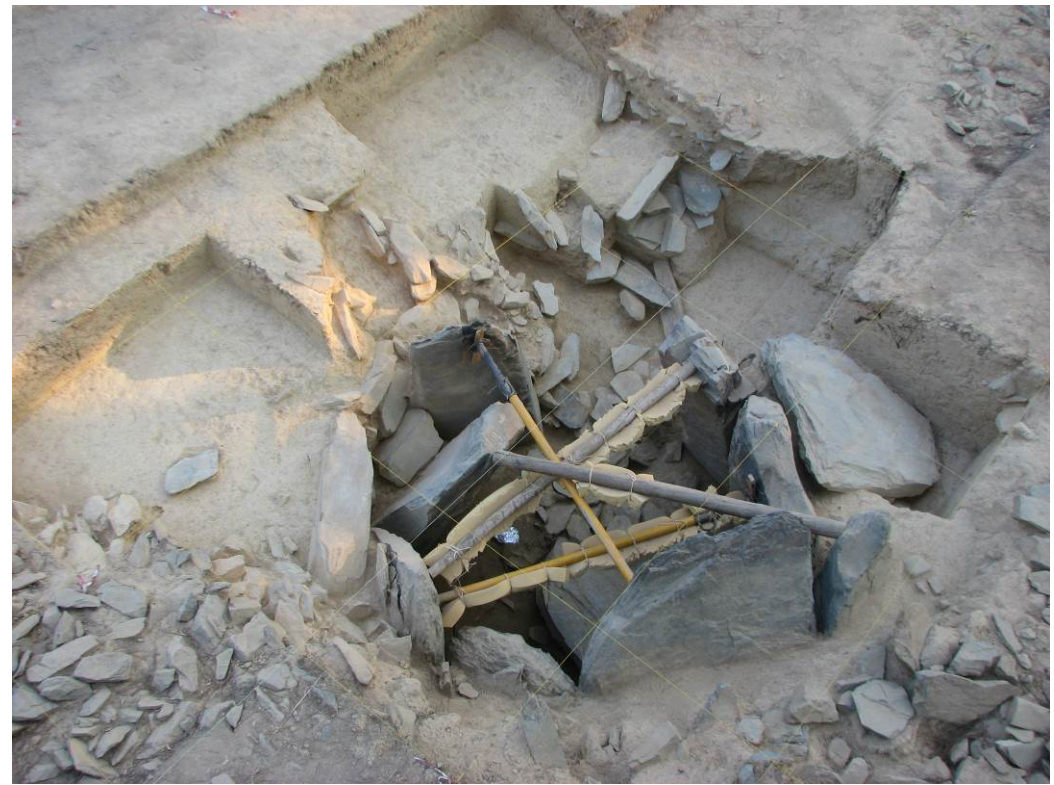
View of the archaeological dig of the chamber at the end of the campaign (2016)