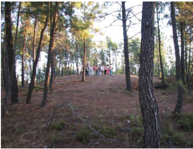
View of Cabeço da Anta.