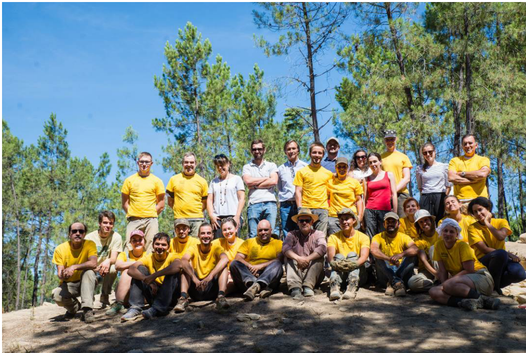
The team (2017)