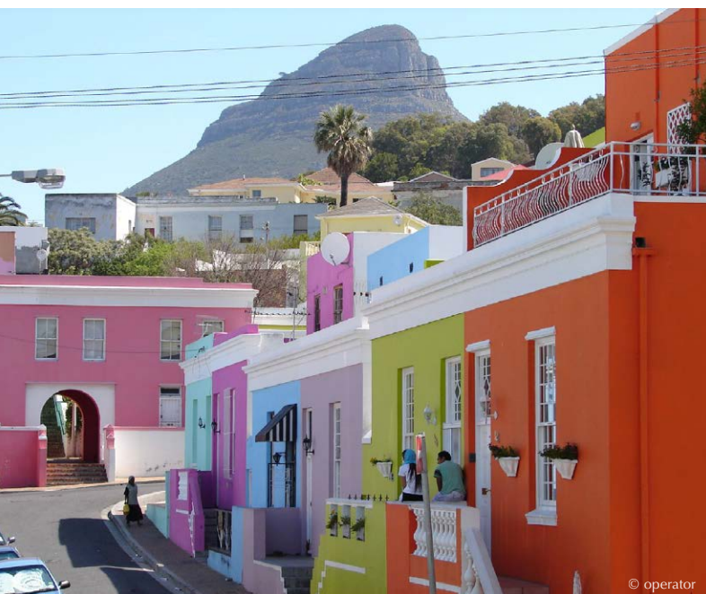
Bo-Kaap (Malay Quarter), one of Cape Town's oldest residential areas

Discover the spectacular valleys and mountains of the Cape Winelands, the center of South Africa's award-winning wine