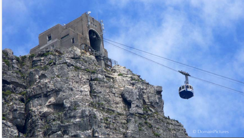
A cable car near the top of Table Mountain, Cape Town