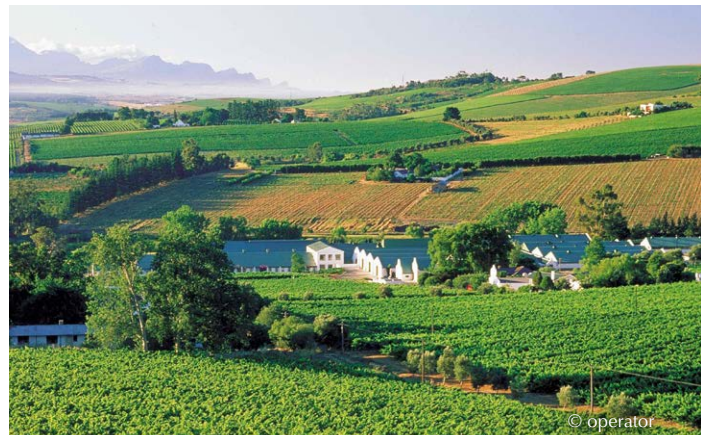
One of the many vineyards in the Cape Winelands

Depart the hotel this morning after breakfast, and take a scenic, 4.5-hour drive to Mossel Bay along the Garden Route and coastal highway. Stop to visit the small but significant Blombos Museum of Archaeology, dedicated to presenting the prehistory of the area and specifically the findings from Blombos Cave, inhabited by early modern humans between 100,000 and 70,000 years ago. Curator Chris Heese (schedule permitting) will guide us through the displays, which provide context for the symbolic objects (the world's earliest) and ochre-processing "workshop" for which the cave is renowned. Continue on to Mossel Bay and check-in to our hotel in the afternoon. The balance of the day is at leisure. Overnight at the 4-star Protea Hotel Mossel Bay for two nights. (B,L)