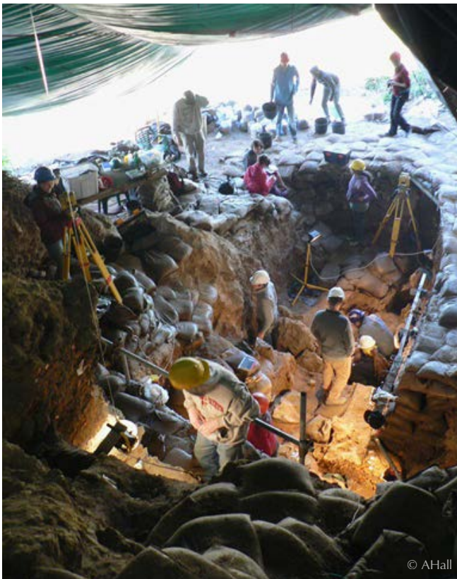
Pinnacle Point Caves