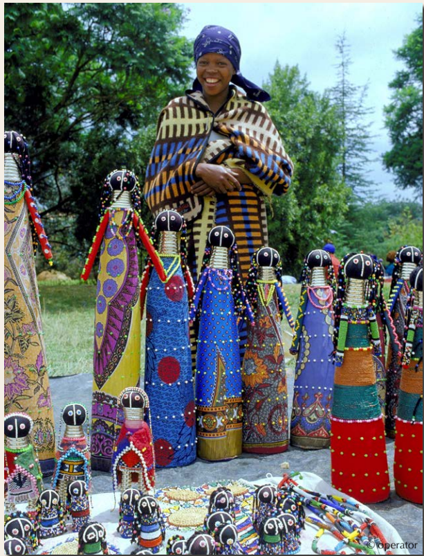
A South African woman displays her craft.