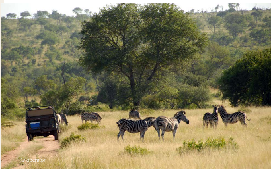
Kapama Game Reserve

Weather in South Africa is generally pleasant at the time of our visit, as it will be early spring in the Southern Hemisphere. Cape Town and Johannesburg will remain crisp and cool in the early mornings and evenings, and will be pleasant during the day (65°-75°F). Cape Town tends to be wetter, so expect a few showers. Weather during the safari is also chillier in the early mornings and evenings, and pleasant during the day. Cave temperatures average 60°-65°F, and humidity levels reach 95%. Please note that no photography is allowed inside the caves. Complete pre-departure details and what to pack will be sent to participants.