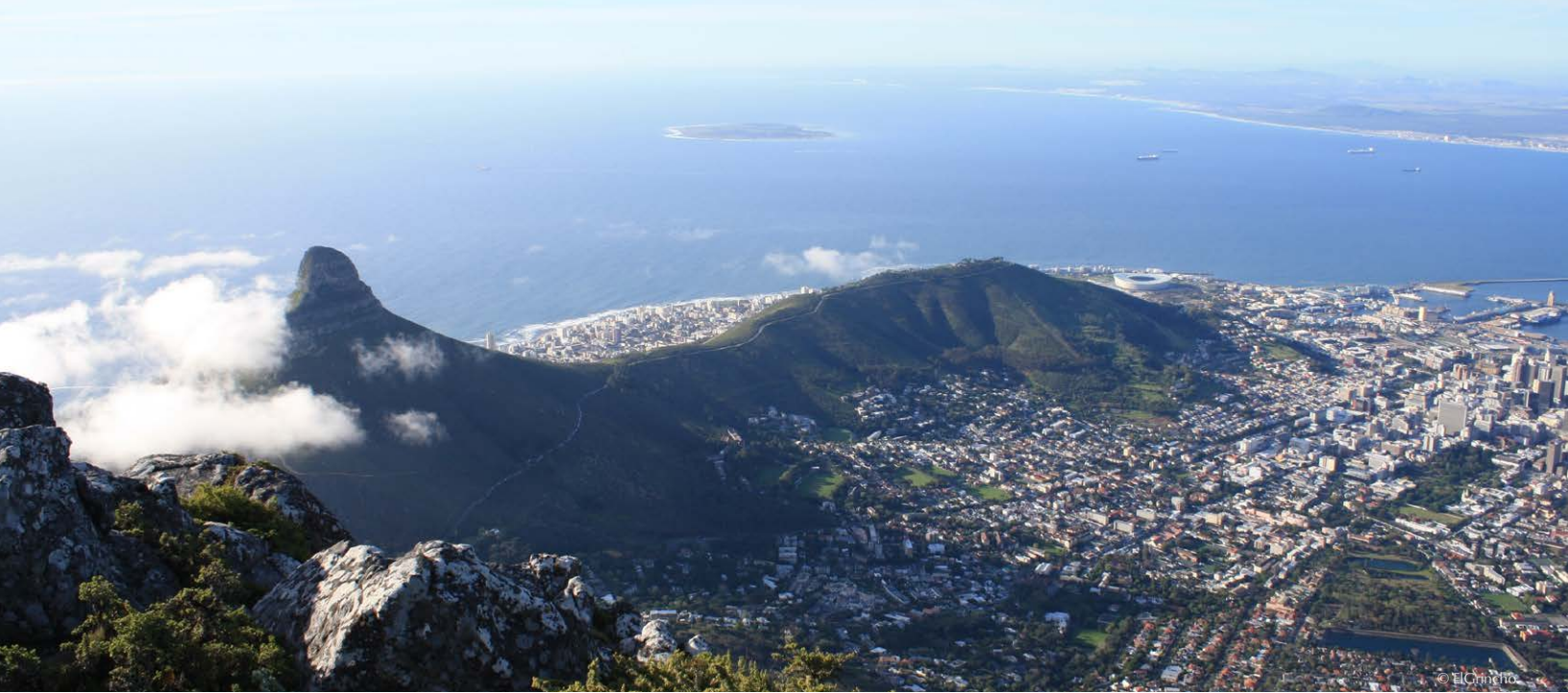
A view from Table Mountain overlooking Cape Town

industry. Enjoy a wine tasting at Vergenoeg Wine Estate, followed by lunch at Die Werf Restaurant, located at the impressive Boschendal Wine Estate with its exceptionally well-maintained gardens and Manor House. Return to our Cape Town hotel in late afternoon for the balance of the day at leisure. (B,L)