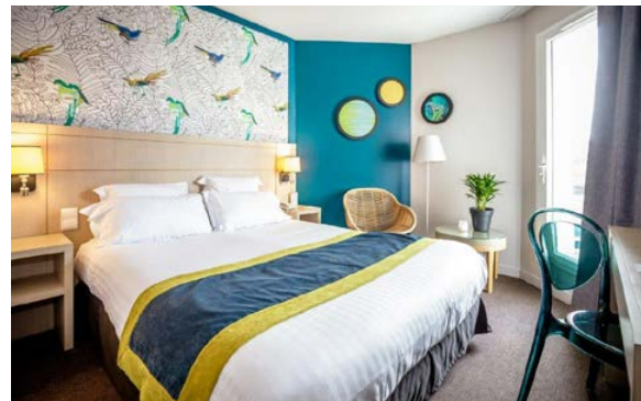
Vannes Three nights at the 4-star Best Western Plus Vannes Centre Ville