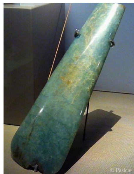
A jadeite axe found near Breamore, Hampshire, at the Wiltshire Heritage Museum

Transfer this morning to Paris Charles de Gaulle Airport (CDG) for flights homeward. (B)