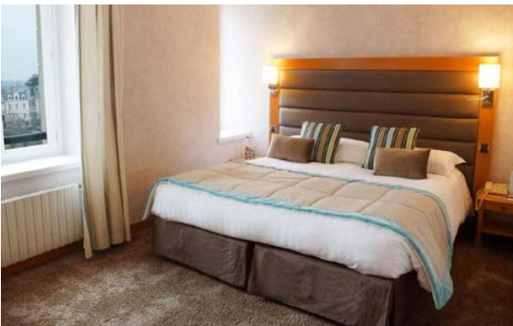
Saint-Malo One night at the 5-star Le Grand Hôtel des Thermes