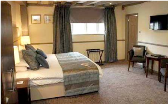
Salisbury Three nights at the 4-star Legacy Rose and Crown Hotel