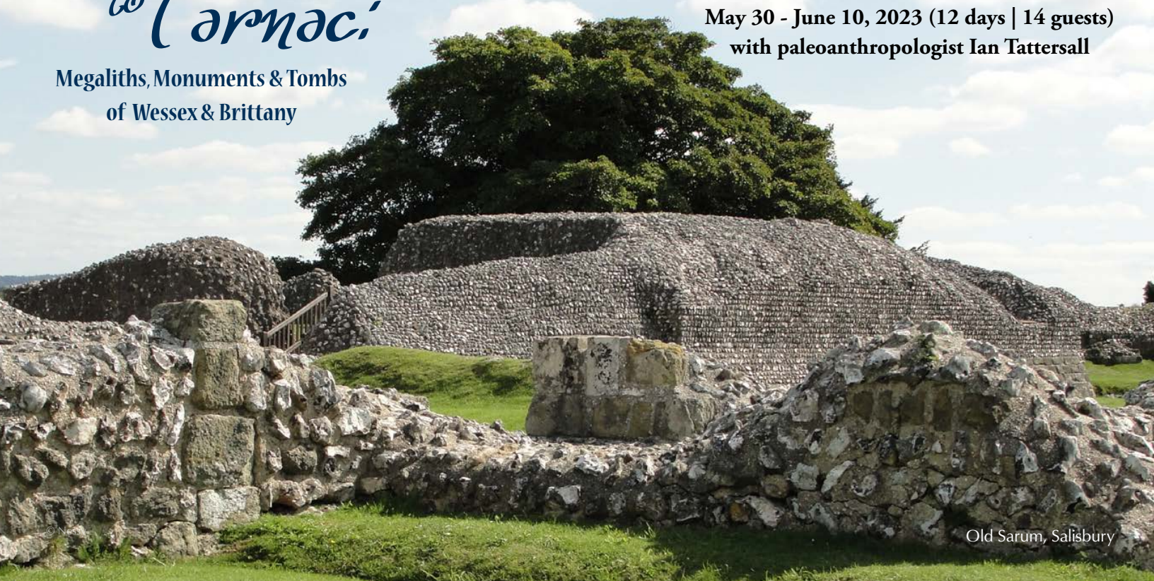
Old Sarum, Salisbury

May 30 - June 10, 2023 (12 days | 14 guests) with paleoanthropologist Ian Tattersall