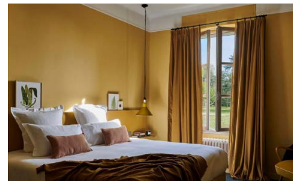
St.-Germain-en-Laye One night at the 4-star Maison du Val