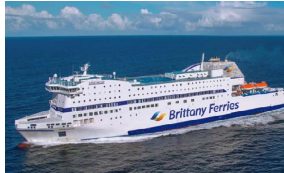
Ferry One night aboard the ferry from Portsmouth, England to Saint-Malo, France