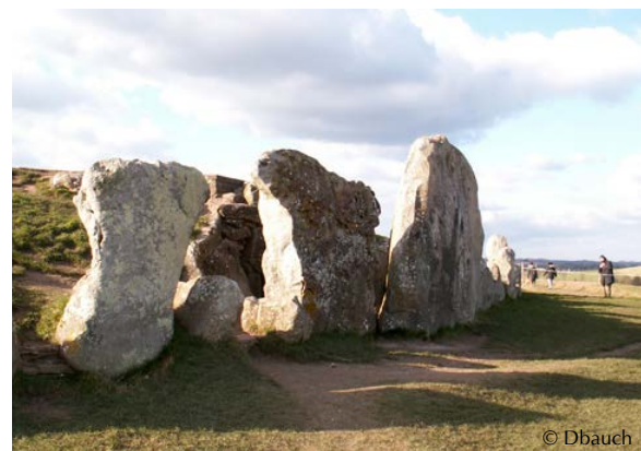
West Kennet Long Barrow

Check out of our hotel this morning and drive to the UNESCO World Heritage Site of Mont-Saint-Michel. After a guided visit of this imposing,