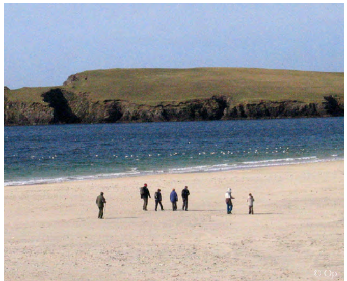
Travelers on the tombolo to St. Ninian's Isle.

Arrive in Aberdeen this morning, and transfer to Aberdeen International Airport (ABZ) for independent flights homeward. Flights should depart no earlier than 11:00am. (B)