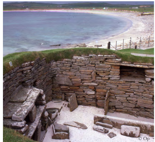
Above: Skara Brae, a late Neolithic settlement. Below: The Ring of Brodgar, a stone circle that is 341 ft. in diameter, is the third largest in the British Isles.