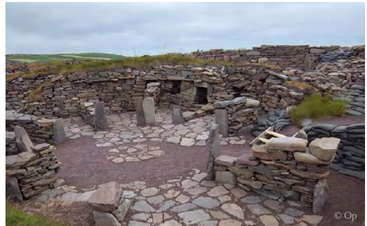
Above: Old Scatness on south mainland, Shetland. Below: Hermaness, Isle of Unst.