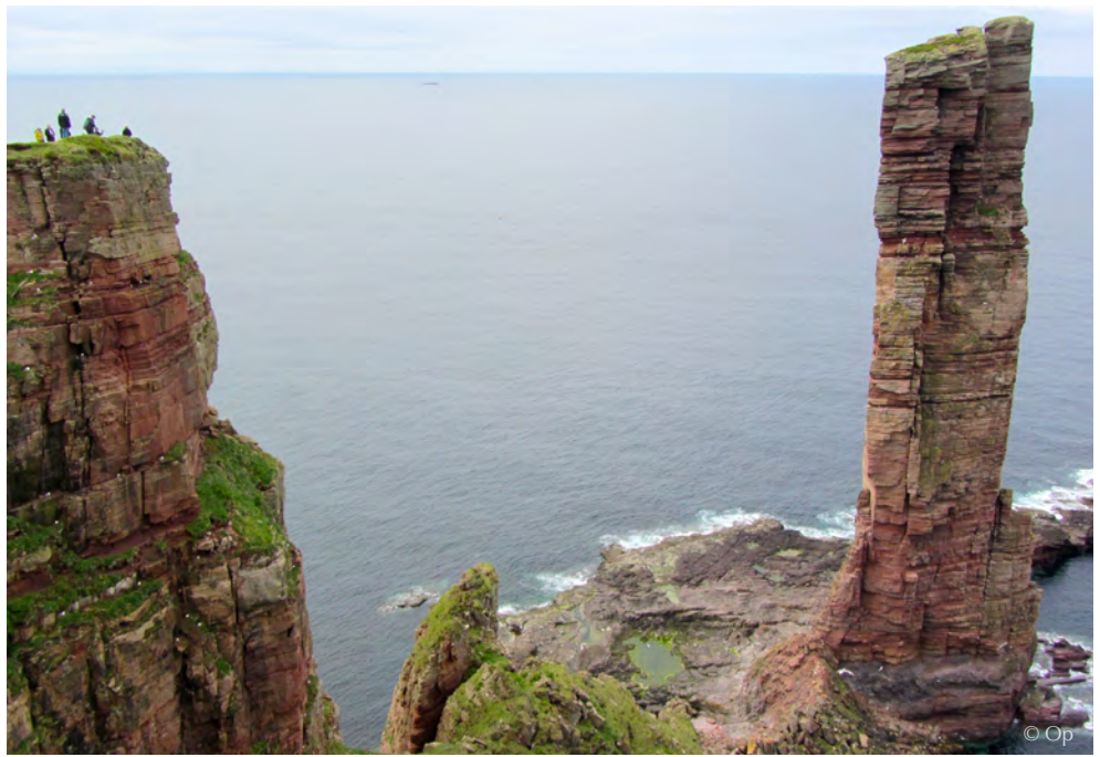
The Old Man of Hoy stands 450 ft. high in the Orkney Islands.

Fethaland is the northernmost part of Shetland's mainland. We walk to a ruined haaf ("open sea") fishing station dating from the 18 th and 19 th centuries. The ever-enterprising lairds established this and other haaf fishing stations on remote northwestern parts of Shetland to profit from the catch of ling and cod during the summer months. Extremely brave fishermen ventured out (50 miles) into the Atlantic Ocean in open boats called sixareens. Set within the fishing station are a large, circular Neolithic house and a ruined Iron Age broch. Another place of interest that we will encounter during our walk is a Viking soapstone quarry. Overnight at the Busta House Hotel for two nights. (B,L,D)