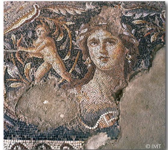
The "Mona Lisa of the Galilee" mosaic at Sepphoris