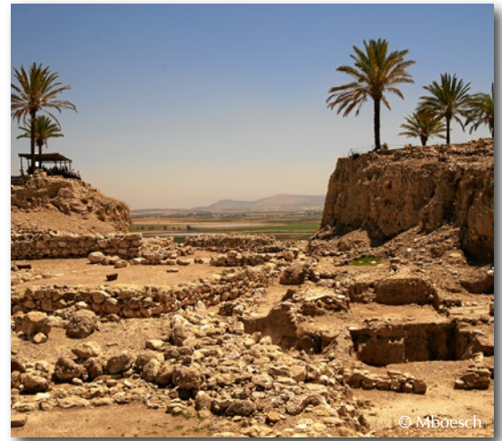
Tel Megiddo, a UNESCO World Heritage site

Overnight for six nights at the 5-star Waldorf Astoria . (B,L,D)