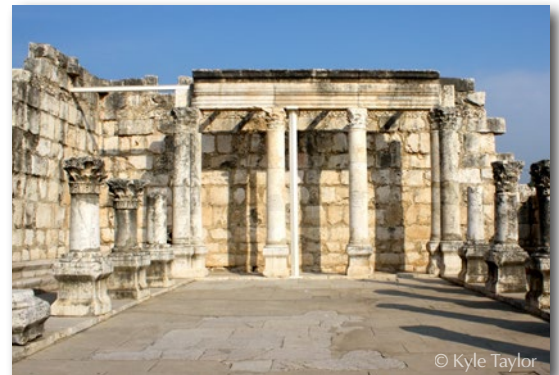
Ruins of the ancient synagogue at Capernaum