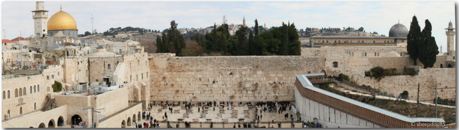
Jerusalem's Western Wall with the Dome of the Rock (left) and Al-Aqsa Mosque (right)

Begin today with a morning visit to the W. F. Albright Institute of Archaeological Research, housed in an historic building in East Jerusalem, north of the Old City. From there we will set out on a walking tour, following Jerusalem's "Third Wall" from the grounds of the Albright Institute south to the Damascus Gate, where we enter the Old City. Walk along the Via Dolorosa to the Church of the Sisters of Zion and the Church of the Holy Sepulchre, the holiest site in the Christian world. After lunch, the balance of the day is at leisure. (B,L)