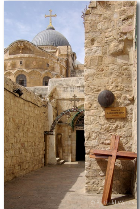
Station IX of the Via Dolorosa, Jerusalem

Today we depart Jerusalem and drive to the UNESCO World Heritage site of Masada. Built by Herod as a fortified palace, Masada later was the site of a famous "last stand" by almost 1,000 Jews, following the Roman conquest of Jerusalem in A.D. 70. At a resort in Ein Boqueq, south of Masada, we will have lunch and you may take a dip, if you wish, in the Dead Sea—the lowest point on Earth. End the day at Qumran, where the famous Dead Sea Scrolls were hidden for nearly 2,000 years, and then return to Jerusalem. Dinner is on your own this evening. (B,L)