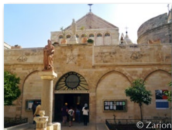
St. Catherine's Church, Bethlehem

Today visit the Israel Museum (including the Shrine of the Book, which houses some of the Dead Sea Scrolls) with its very large scale model of Jerusalem, depicting the city at the time of the Second Temple. Continue to the center of town to visit Mahane Yehuda, an open-air market where you can view (and sample) fresh produce and spices. After lunch we visit Bethlehem, with its Church (Basilica) of the Nativity—the world's oldest continuously operating church, established in A.D. 326, and today a UNESCO World Heritage site—and