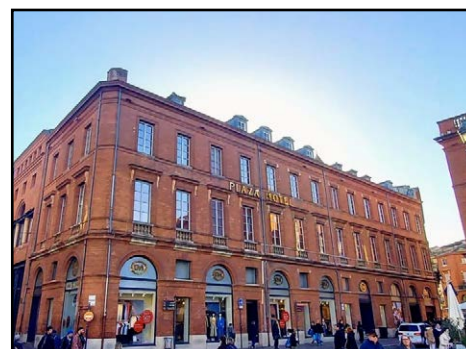
Toulouse, France: Two nights at the 5-star Plaza Hotel Capitole