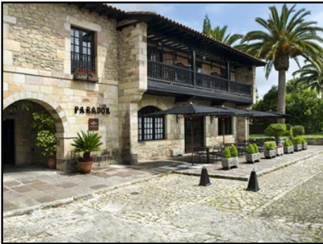
Santillana del Mar, Spain: One night at the 4-star Parador de Santillana Gil Blas