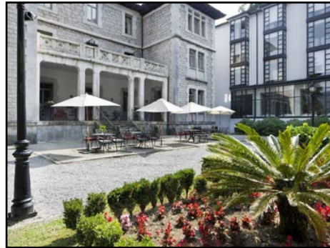
Limpias, Spain: One night at the 4-star Parador de Limpias