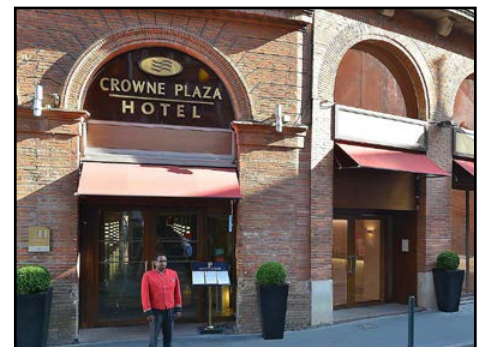
Toulouse, France: Two nights at the 5-star Hotel Crowne Plaza