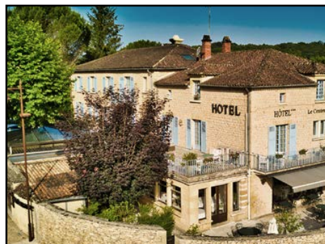
Les Eyzies, France: Four nights at the 4-star Hôtel le Centenaire