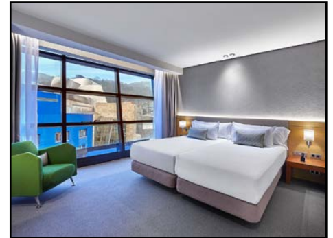
Bilbao, Spain: Two nights at the 5-star Gran Hotel Domine