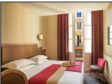
Bordeaux, France: One night at the 4-star Best Western Premier Hotel Bayonne Etche-Ona