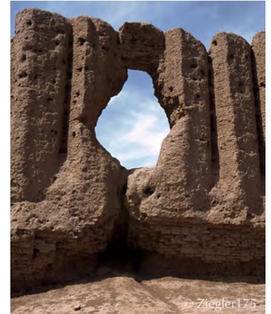
Left, Anau, Turkmenistan. Above, Merv, Turkmenistan.