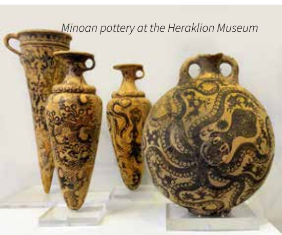
Minoan pottery at the Heraklion Museum