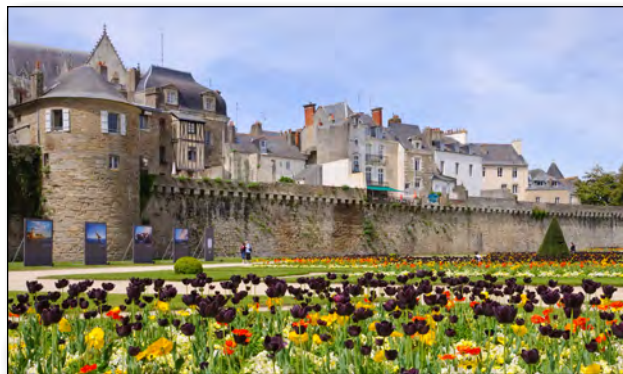
Above, Vannes, France. Below, La Roche aux Fées (Fairies’ Rock), Essé. Bottom left, Mont-Saint-Michel. Bottom right, the tumulus of Gavrinis.

Transfer this morning to Rennes Bretagne Airport (RNS) for flights homeward. (B)