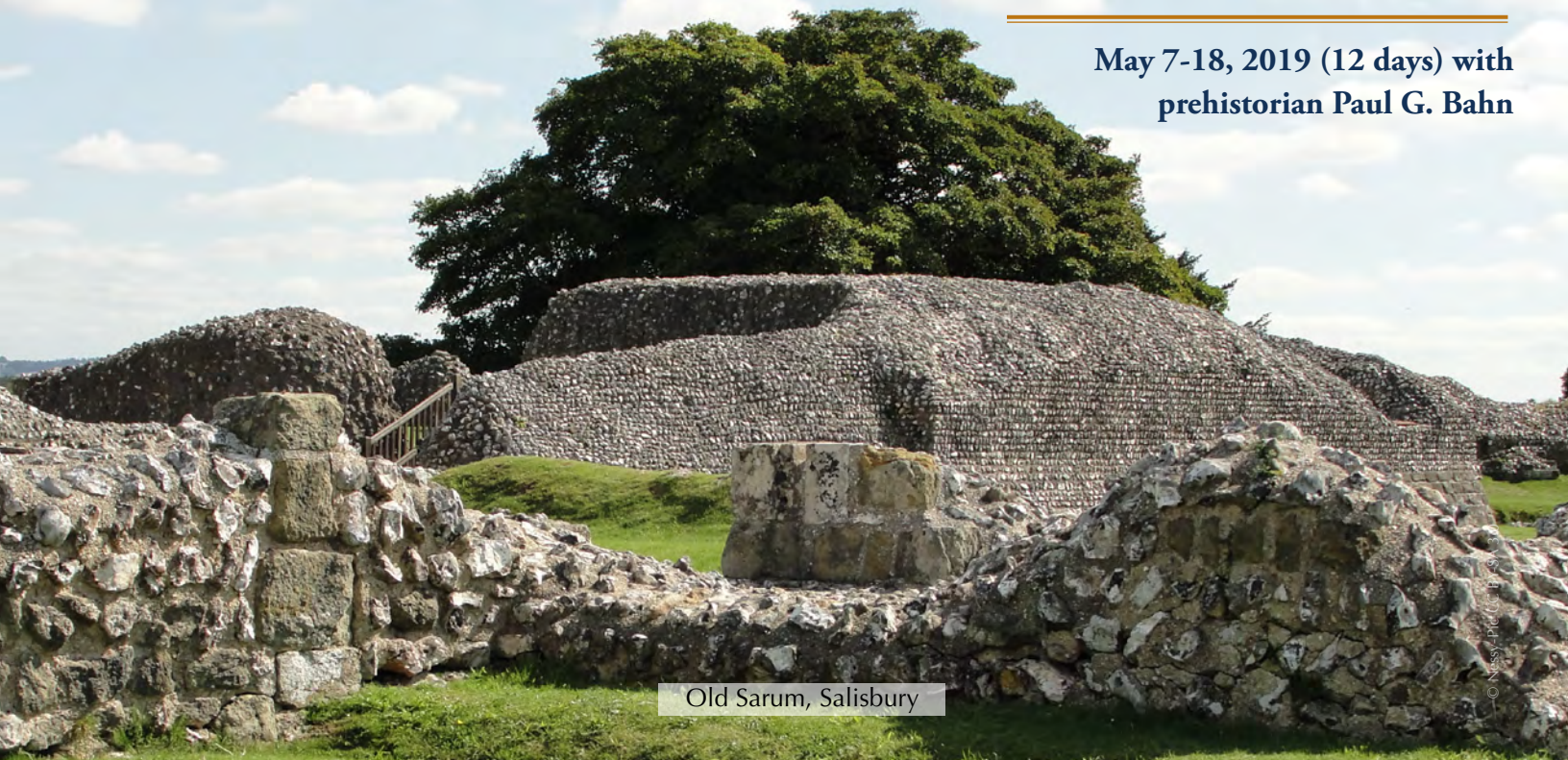
Old Sarum, Salisbury