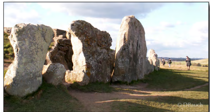
Above, West Kennet Long Barrow. Below, Champ Dolent menhir.

Check out of our hotel and meet our local expert again for today's site visits. Drive to Locmariaquer and take a boat ride to visit the impressive tumulus of Gavrinis, a cairn of large stones in a stepped pattern that resembles a squat pyramid. After an independent lunch at the harbor, visit the Table des Marchands, a 98-foot-long dolmen; the Neolithic Grand Menhir Brisé (“great broken standing stone”); and the heavily engraved dolmen of Mané-Lud. Drive to Vannes, where we check-in to our hotel and have dinner. Overnight at the Best Western Plus for two nights. (B,D)