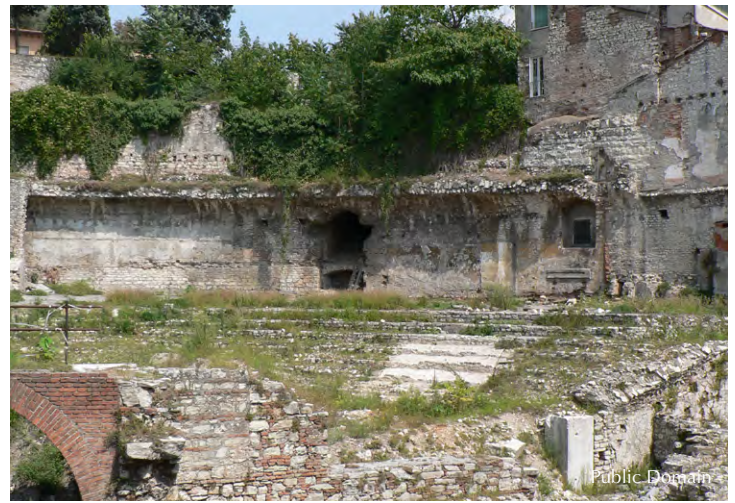
Above, the ancient Roman theater at Brescia.

Today we check out of our hotel and take a motorcoach to Trieste, our home base for the balance of our journey. On the way, stop in Verona to visit the 1 st -century A.D. Roman arena, possibly the best-preserved ancient amphitheater, and for a walking tour of the hidden gems of Verona (the city is a UNESCO World Heritage site). Our special lunch today is a typical Veronese meal at Ristorante Maffei, which was built on the site of the 1 st -century B.C. Roman Capitol, part of which is visible in its wine cellar. Continuing on to Trieste, we check-in to our hotel. Dinner is on your own. Overnight for five nights at the 4-star Grand Hotel Duchi d'Aosta . (B,L)