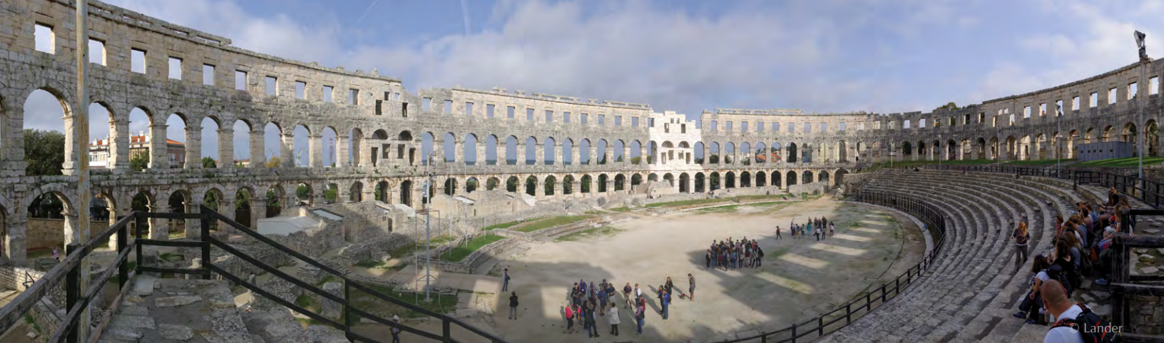
The Roman amphitheater at Pula, Croatia

archaeological evidence of human occupation (settlement, burial, and ritual) in the caves dating back to the prehistoric era. We continue on to Ljubljana, Slovenia's capital city and Green Capital of Europe for 2016, whose city center includes the remains of the Roman city of Emona, with one of the longest Roman city walls in central Europe. After a group lunch, the afternoon is at leisure in Ljubljana. We return to Trieste, where dinner is on your own tonight. (B,L)