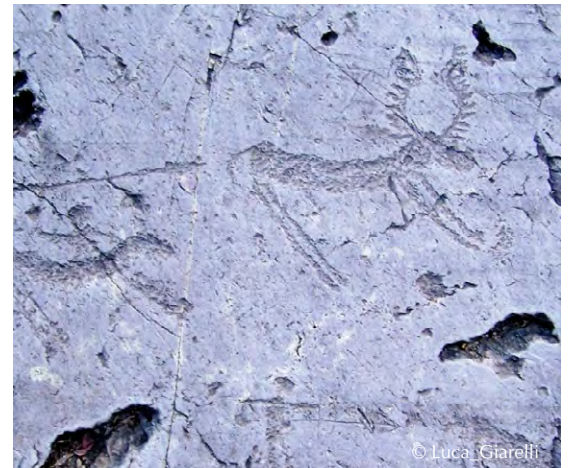
Valcamonica deer hunting scene