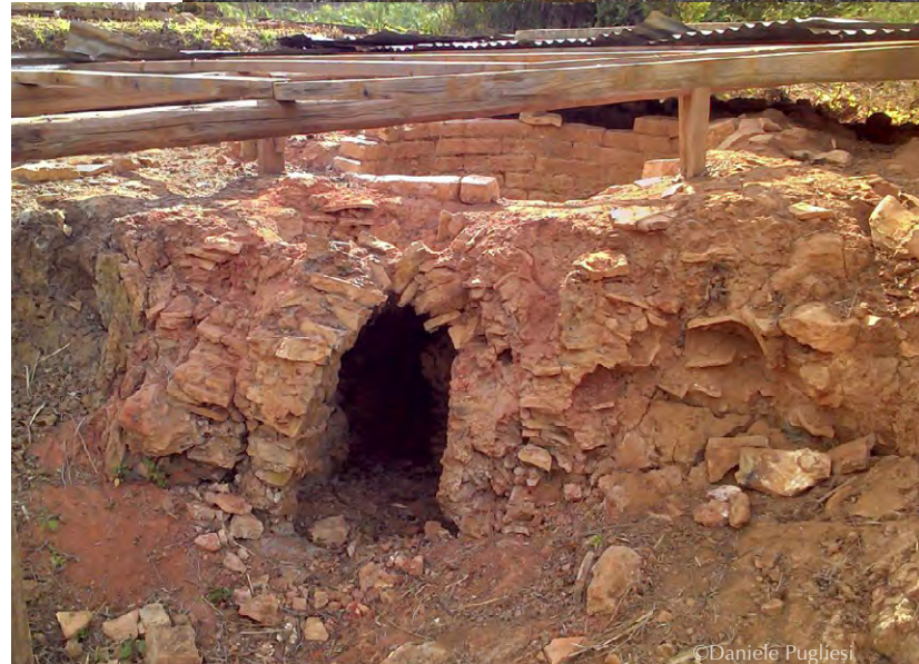
Right (top): The Milan Cathedral; (middle) Grotte di Catullo; (bottom) Gorgi's Roman furnaces.