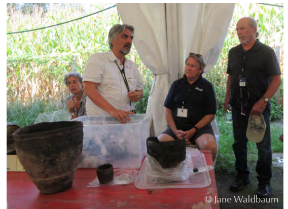
Local archaeologist and AIA travelers at Lucone di Polpenazze