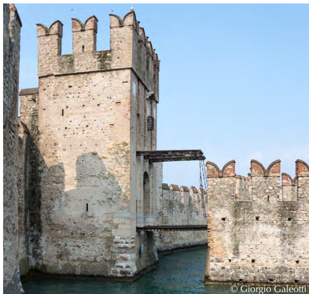
City walls of Brescia

September 4-17, 2019 (14 days) with archaeologist Patrick Hunt