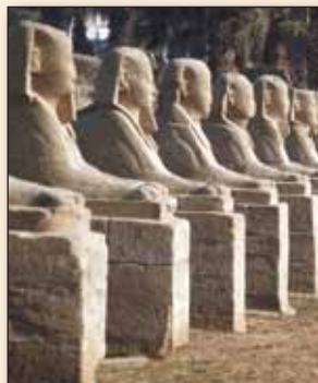
Above, Avenue of Sphinxes at Luxor. Below, royal tomb (KV 14) in the Valley of the Kings.