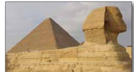
Above, the Great Pyramid of Khufu and the Sphinx. Below, the Temple of Hatshepsut