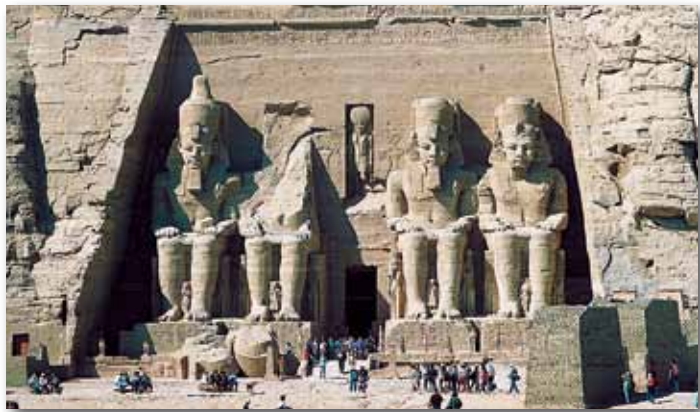
The Temple of Ramesses II at Abu Simbel.