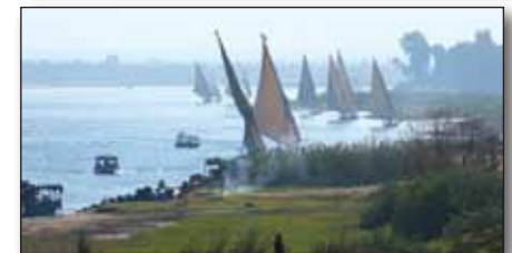
Above, Feluccas lining the Nile River. Below, the Temple of Luxor.