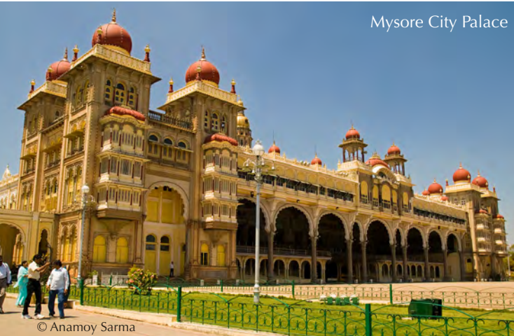
Mysore City Palace

Prst Std U.S. Postage PAID Putney, VT Permit 1