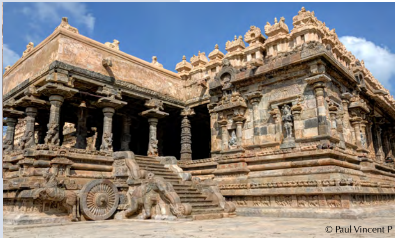
Airavatesvara Temple, Darasuram