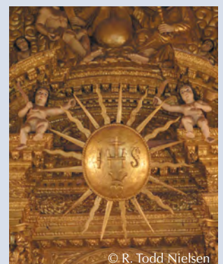
Interior detail of the Church of Bom Jesus, Goa

Travelers who are not on the post-tour extension are transferred this morning to Mumbai's Chhatrapati Shivaji International Airport (BOM) for independent flights homeward. (B)