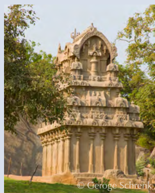
Temple at Mahabalipuram