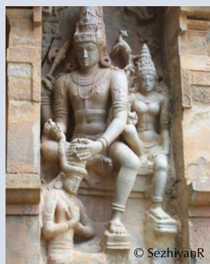
Exterior detail from Gangaikonda Cholapuram