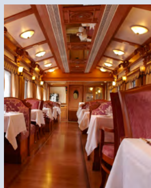
The Golden Chariot train, dining car