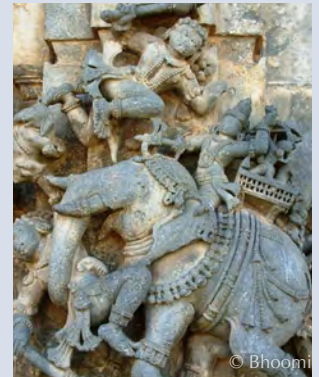
Exterior detail at Belur

Set out this morning for Hampi (Hospet), a UNESCO World Heritage site and one of the most interesting historical sites in southern India, which represents the high point of Vijayanagara art and architecture. Once the capital of the greatest kingship in medieval India (the Vijayanagara kings, who ruled for more than 200 years), the city was the center of international commerce and attracted Portuguese, Arab, Chinese, and Russian explorers and traders. This spectacular complex covers some eight square miles, spread over a vast, hilly area through which runs the Tungabhadra River. The ruins are divided into four significant urban zones that contain temples, mosques, palaces, and other monumental architecture. (B,L,D)