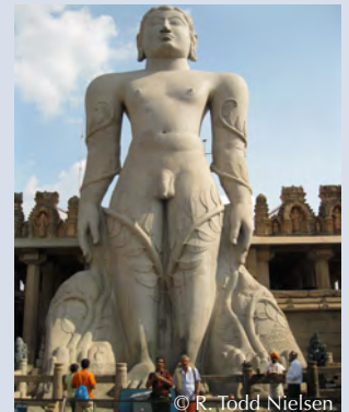
Monolithic granite statue of the Jain enlightened being at Sravanabelagola

Today we will visit magnificent temple sites, including the UNESCO World Heritage site of Pattadakal, the second capital of the Chalukyas. The site's dozen or so temples represent the finest examples of Chalukyan architecture. We will also explore Badami, the famous Chalukyan capital from around A.D. 540 to 757. Both sites were important centers of the great Chalukya kings who ruled the Deccan between the late 6 th and the late 8 th centuries. Badami was their political seat while Pattadakal was the site where coronation ceremonies were held. The red sandstone rock-cut caves and structural temples offer visitors a comprehensive understanding of early Indian temple architecture. (B,L,D)