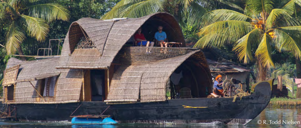
A houseboat cruising the water in Kerala.