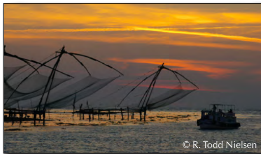
A view from Kochi at sunset.

We disembark our houseboat and drive back to Kochi. In the late afternoon we fly to Mumbai, where day rooms are reserved at The Leela Mumbai hotel (ten minutes from the airport) until 10pm. This evening we are transferred back to the airport in time for flights homeward. (B,L,D)