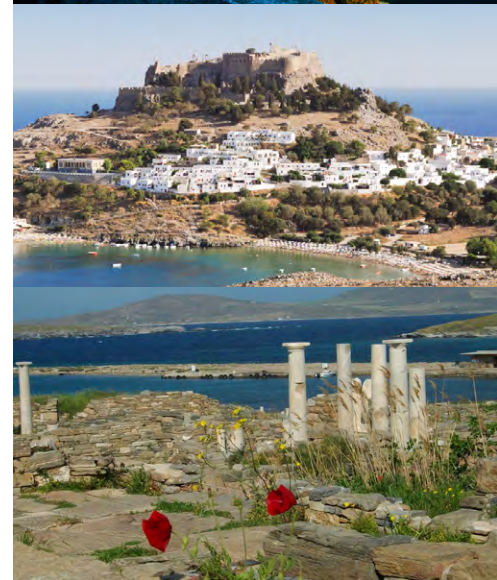
From top, Solin (Salona), Croatia; Santorini, Greece; Lindos, Rhodes, Greece; Delos, Greece.