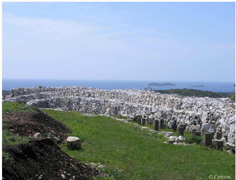
Monkodonja, a Bronze Age hillfort