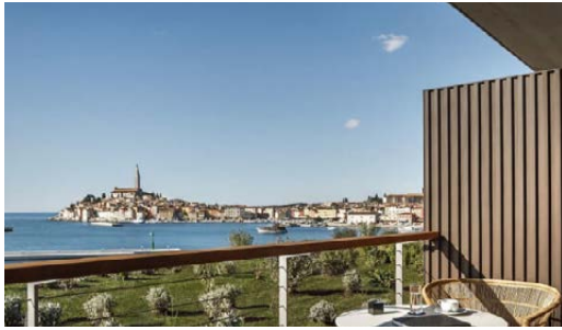
Rovinj: Two nights at the 5-star Grand Park Hotel Rovinj