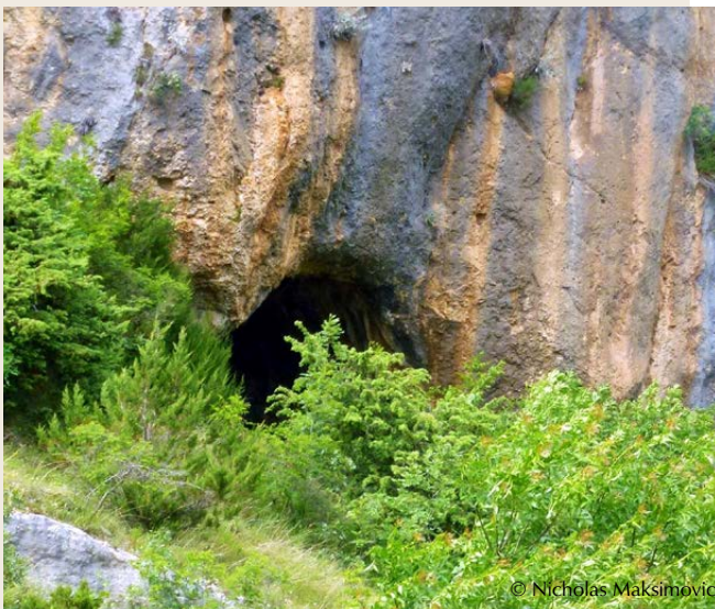
Roški Slap, Krka National Park