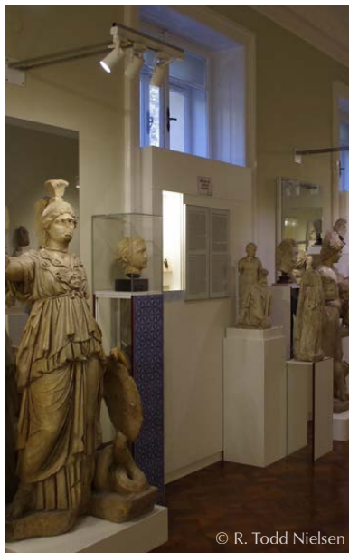
Zagreb Archaeological Museum