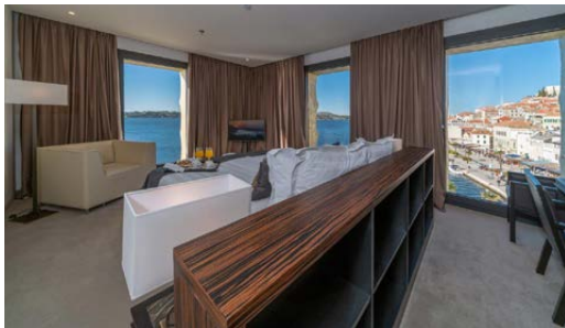
Šibenik: Three nights at the 4-star Hotel Bellevue