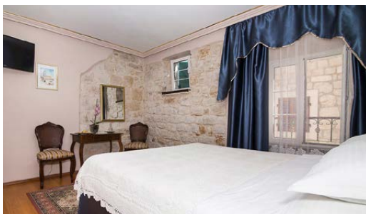
Trogir: One night at the 4-star Heritage Hotel Pasike