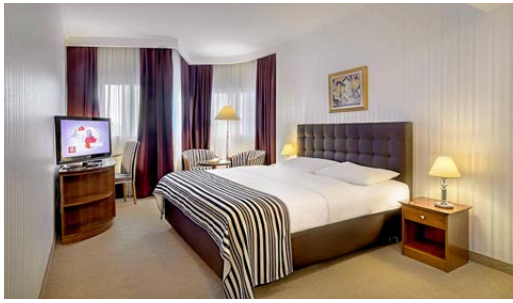
Zagreb: Three nights at the 4-star Hotel Dubrovnik