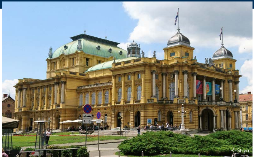
The Zagreb Archaeological Museum, home to more than 450,000 artifacts and monuments.

Drive to Pula and discover one of Croatia's architectural gems: the Roman amphitheater, the only one in the world with a complete outer wall, dating from the first century A.D. and originally designed for gladiatorial combat. Pula