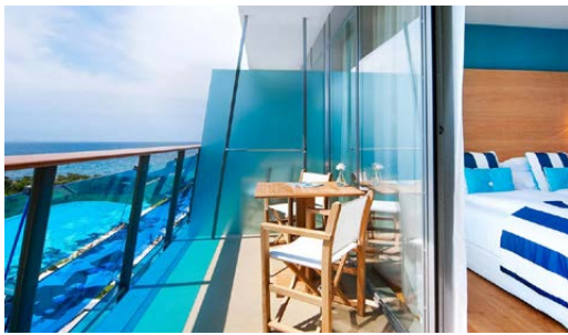
Zadar: One night at the 4-star Falkensteiner Hotel