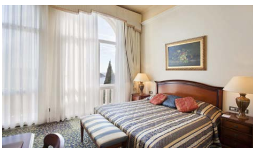
Optional Post-Tour Extension Dubrovnik: Three nights at the 5-star Grand Villa Argentina