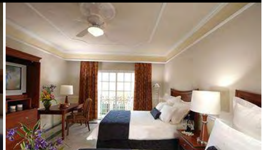
Presidente InterContinental Villa Mercedes Merida

PRICES DO NOT INCLUDE: Any airfare; passport and visa fees; all airport fees and departure taxes; meals on day of arrival; beverages (except as indicated); excess baggage charges; personal, trip cancellation, and baggage insurance; any activities not specified in the itinerary; all items of a personal nature such as laundry, medical expenses, and room service.