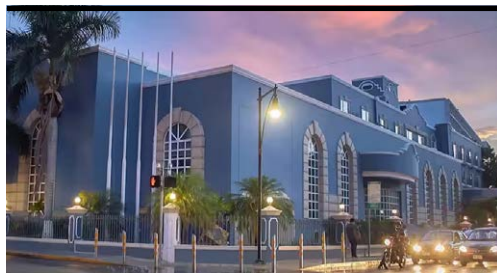
Villa Mercedes Mérida, Curio Collection by Hilton