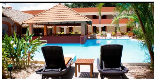
Hotel Villas Arqueológicas Chichén Itzá