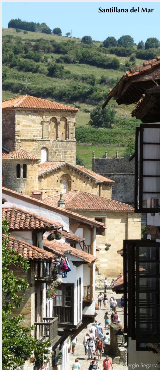
Santillana del Mar

Investigate southwestern Europe's most extraordinary prehistoric caves, including Lascaux IV, a new, exact reproduction of one of the most remarkable prehistoric sites ever discovered; Altamira II, a precise replica of the original that is often called the "Sistine Chapel of Prehistoric Art"; Atapuerca, the most significant early human site in western Europe; Las Monedas Cave and Cueva del Castillo, where 455 animal likenesses were painted and engraved some 22,000-14,000 years ago, but other motifs such as hand stencils and red dots have been dated to more than 40,000 years ago, meaning that they may well have been made by Neanderthals; Cougnac, which features paintings of extinct megaloceros and mammoth; Pech Merle, known for its "negative handprints"; and others.