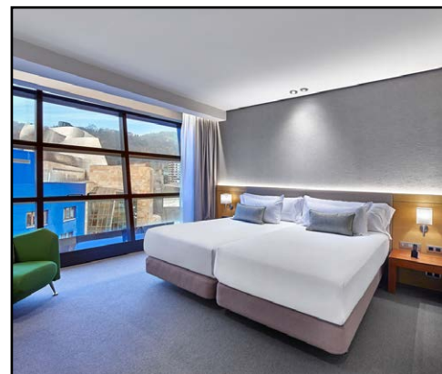
Bilbao, Spain: Two nights at the 5-star The Artist-Grand Hotel of Art