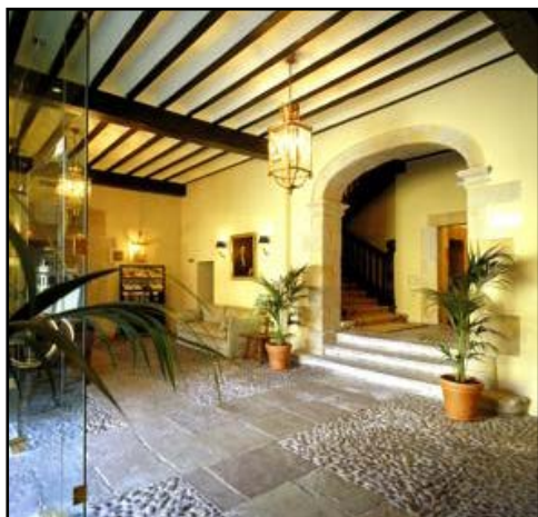
Santillana del Mar, Spain: Two nights at the 4-star Parador de Santillana Gil Blas