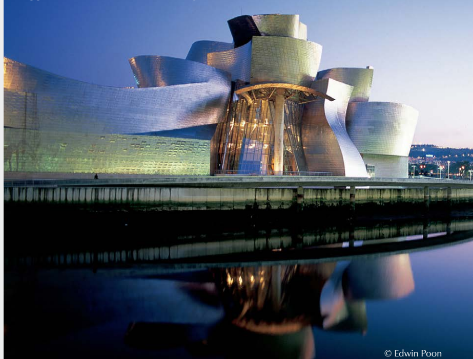
Guggenheim Museum in Bilbao, Spain