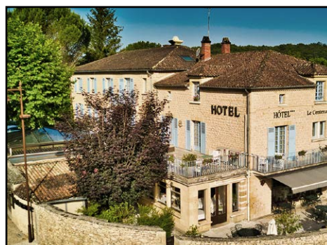
Les Eyzies, France: Four nights at the 4-star Hôtel le Centenaire