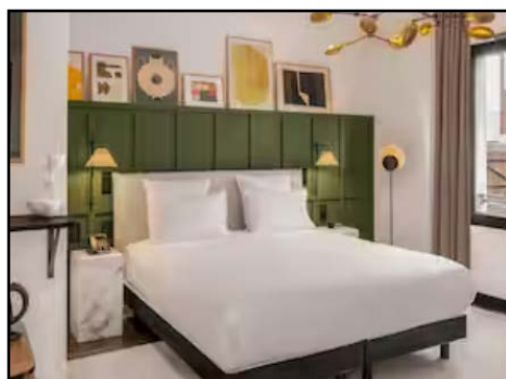
Bordeaux, France: One night at the 4-star Marty Hotel Bordeaux