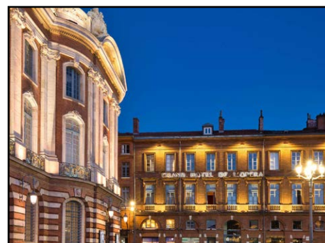
Toulouse, France: Two nights at the 4-star Le Grand Hôtel de L'Opéra, Toulouse