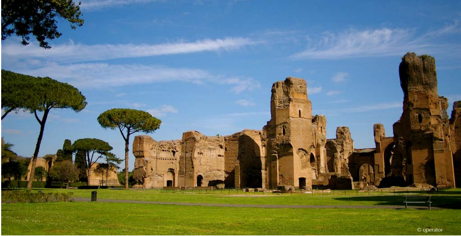
Baths of Caracalla (Rome)