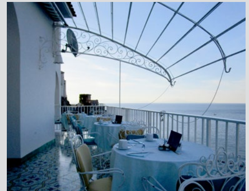
AMALFI - Overnight for three nights at the 4-star Hotel Marina Riviera