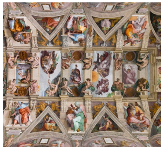
Michelangelo's magnificent and restored ceiling in the Sistine Chapel with scenes from the Book of Genesis

Early this morning drive to the Vatican and enjoy breakfast within the Vatican Museums. Then enter the ornate Raphael Rooms and Michelangelo's masterpiece, the Sistine Chapel. Explore the sumptuously decorated St. Peter's Basilica, the largest church in the world. Admire Michelangelo's wonderful Pietà and the gigantic bronze canopy by Bernini. Enjoy some free time in the most important church in all Christendom; perhaps see the tombs of the Popes or ascend the dome for magnificent views of the entire city. After lunch, you may choose to be driven back to our hotel or join a splendid guided walk past the famous Castel Sant'Angelo (Castle of the Holy Angel), a towering cylindrical building built by Emperor Hadrian as his family's mausoleum that was later used by the popes as a fortress and castle. Cross the Tiber River to the grand Piazza Navona, originally an ancient stadium, and gaze upon Bernini's celebrated Fountain of the Four Rivers (with Egyptian obelisk). Continue to the awe-inspiring Pantheon, built in the 2 nd century A.D. by Emperor Hadrian as a temple to all the gods. It remains the largest unreinforced concrete dome ever built and a testament to ancient Roman engineering. Return to our hotel with the balance of the afternoon at leisure. Gather for dinner this evening. (B,L,D)