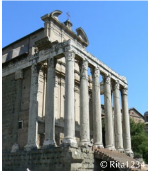
Temple of Antoninus and Faustina, Rome

Meet our AIA lecturer, tour manager, and Rome guide at breakfast. We begin with a visit to the Palatine Hill, centermost of the Seven Hills of Rome, standing above the Roman Forum on one side and the Circus Maximus on the other. From the time of Augustus, Rome's first Emperor, imperial palaces were built here. Visit the House of Augustus, which reopened in 2008 after extensive restoration; its colorful wall paintings and mosaic floors are stunning. Continue with a walk through the Roman Forum, the public center of ancient Rome where the popular assembly and senate met. Here we enjoy a private visit to one of the best preserved buildings in the forum—the Temple of Antoninus and Faustina, which is closed to the public. Savor a traditional Italian lunch just a few steps from the Colosseum. Next view the splendid Arch of Constantine