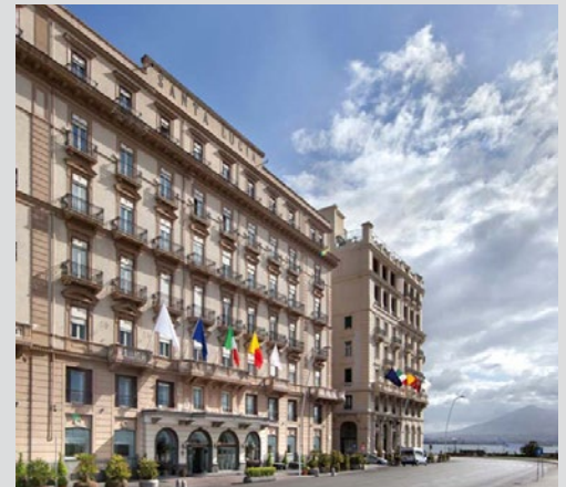
NAPLES - Overnight for two nights at the 4-star Grand Hotel Santa Lucia