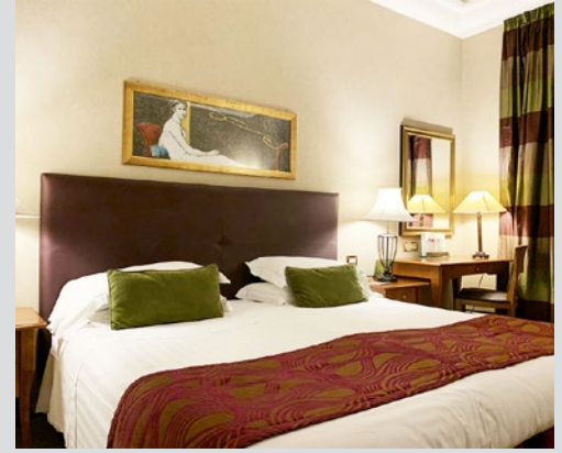
ROME - Overnight for five nights at the 4-star Hotel dei Mellini

Spend ten nights at elegant, well-located, 4-star hotels