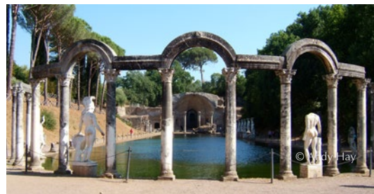
The pool ( Canopus ) at Hadrian's Villa

Visit Tivoli, a town hosting some of Italy's top cultural treasures, less than one hour's drive from Rome. Begin at the World Heritage site of Hadrian's Villa, a 2 nd -century A.D. complex of buildings featuring marvelous pools, baths, fountains, gardens, theaters, and the Imperial Palace. After lunch in Tivoli's charming town center, continue on to another World Heritage site, the magnificent Villa d'Este, a Renaissance palace with an elaborate garden and dozens of fountains. Return to Rome for an evening at leisure. (B,L)