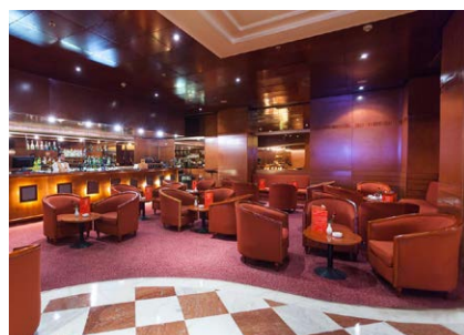
TUNIS: One night at the 5-star Sheraton Tunis Hotel