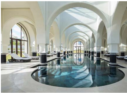
TUNIS: Four nights at the 5-star Four Seasons Hotel Tunis