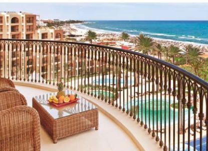
SOUSSE: Two nights at the 5-star Mövenpick Resort & Marine Spa