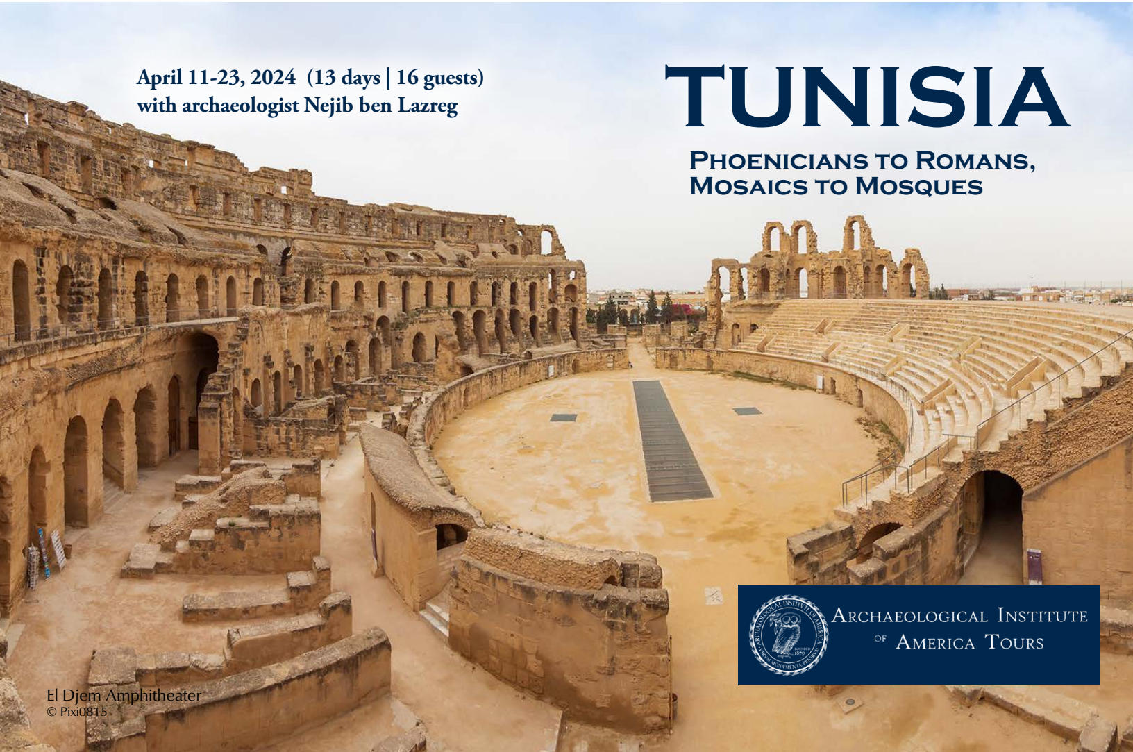
El Djem Amphitheater

PHOENICIANS TO ROMANS, MOSAICS TO MOSQUES