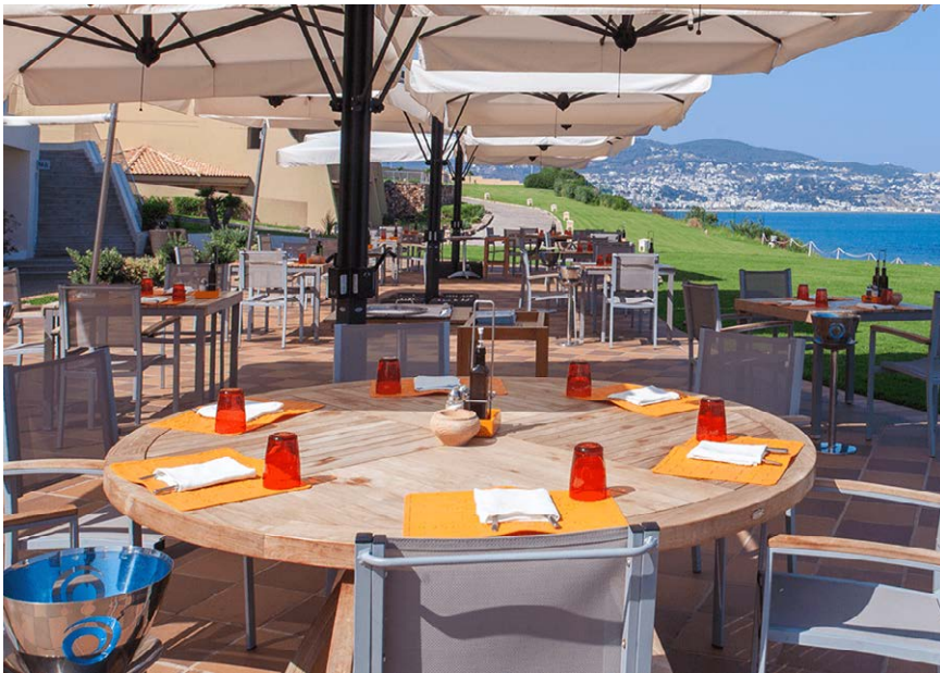
La Cigale Tabarka Hôtel