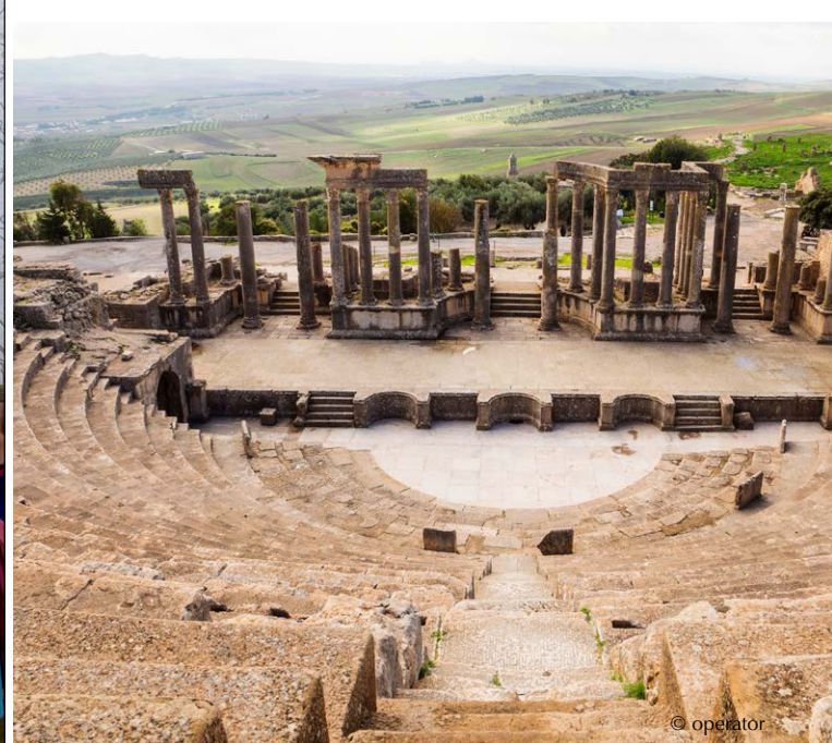
Both the Bardo and El Djem Museums are superb, with extensive collections of mosaics and sculptures. Above, left, is the El Djem Museum and below, left, is one of the Bardo Museum's numerous exquisite mosaics ("rugs in stone"). Above, right, is the theater at Bulla Regia.

town will include (from the outside) the Great Mosque, originally constructed in A.D. 850; the 9 th -century ribat (fortification and religious building); and the souk, which is dominated by woolworkers. After lunch, the balance of the day is at leisure to enjoy our hotel's amenities and/or explore independently the nearby city center. Dining suggestions will be provided. (B,L)