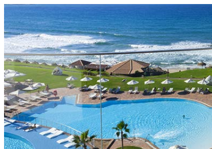
TABARKA: Two nights at the 5-star La Cigale Tabarka Hôtel