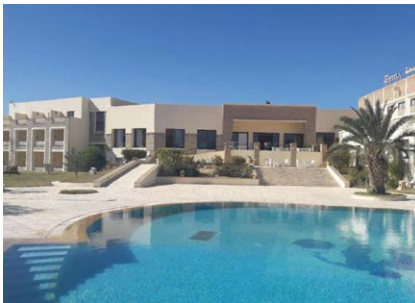
SBEITLA: One night at the 3-star Hotel Suffeïtla