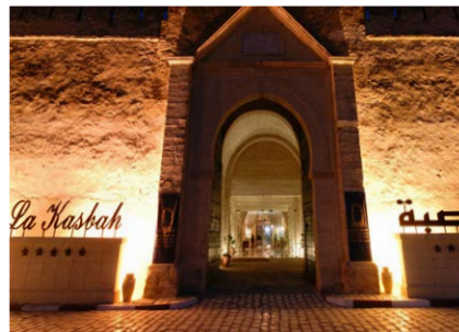
KAIROUAN: One night at the 5-star Hôtel La Kasbah