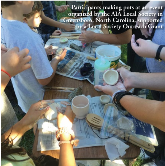
Participants making pots at an event organized by the AIA Local Society in Greensboro, North Carolina, supported by a Local Society Outreach Grant