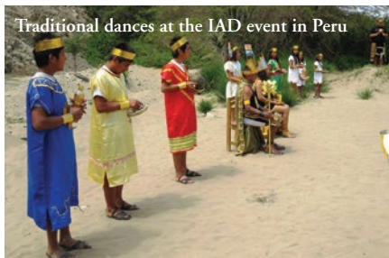
Traditional dances at the IAD event in Peru

of an ancient rite honoring Pachamama (Mother Earth), preparation and tasting