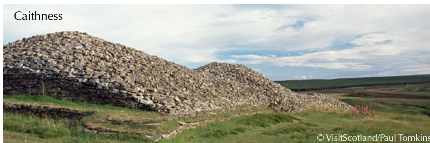
Cover: (top) Callanish Standing Stones © amritagrace, (bottom, clockwise from top center) Little Assynt, a puffin on Handa Island, Traigh Uige, Carloway, a Highland cow, staircase inside Dun Carloway. © operator photos

Scotland's long and varied history stretches back many thousands of years, and archaeological remains ranging from Neolithic cairns and stone circles to Iron Age brochs (ancient dry stone buildings unique to Scotland), medieval castles, and deserted clearance villages cover these landscapes. Seven of our touring days involve hikes of 4.5 to 6 miles per day, and we will rest and reflect in comfortable hotels that extend Highland warmth and hospitality.