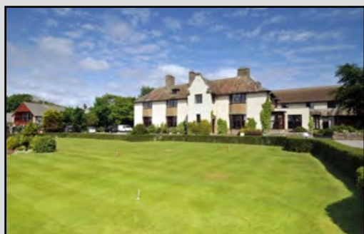
Three nights at the 4-star Royal Marine Hotel in Brora