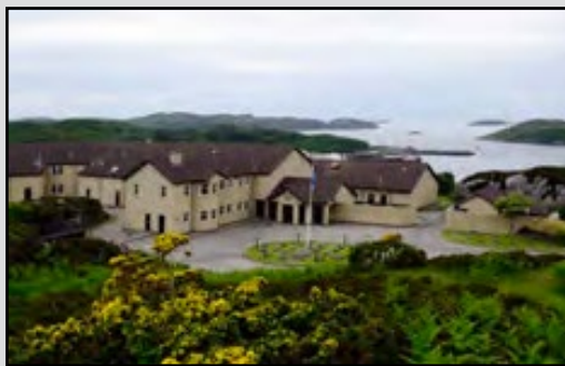
Three nights at the 5-star Inver Lodge Hotel in Lochinver