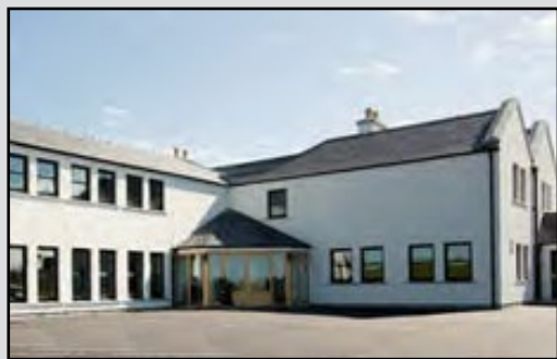
Three nights at the 4-star Borve Country House Hotel in Borve