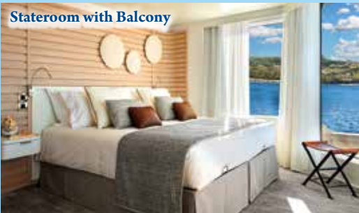
Stateroom with Balcony