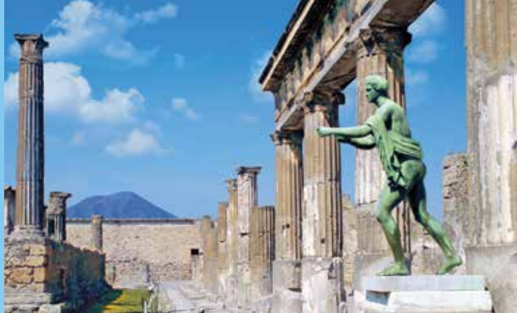
This replica statue of Apollo stands in the impressive Sanctuary of Apollo at Pompeii, with Mt. Vesuvius visible in the background.

to ancient Siracusans, still in use today; the Roman Amphitheater, where gladiators competed for the crowds; the Altar of Hieron II; the limestone Ear of Dionysius cave; and the Archaeological Museum.