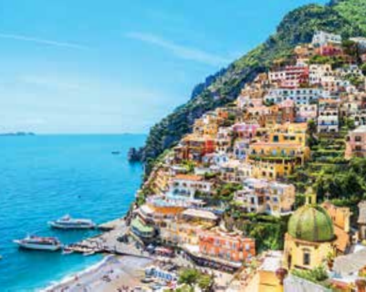
The beguiling coastal village of Positano forms part of the Amalfi Coast, a UNESCO World Heritage site.

RESPONSIBILITY: Gohagan & Company, the sponsoring associations/organizations, and its and their employees, shareholders, subsidiaries, affiliates, officers, directors or trustees, successors, and assigns (collectively "Gohagan"), do not own or operate any entity which is to or does provide goods or services for your trip including, for example, lodging facilities, airline, vessel, or other transportation companies, guides or guide services, local ground operators, providers or organizers of optional excursions, food service or entertainment providers, etc. All such persons and entities are independent contractors. As a result, Gohagan is not liable for any negligent or willful act or failure to act of any such person or entity or of any other third party.