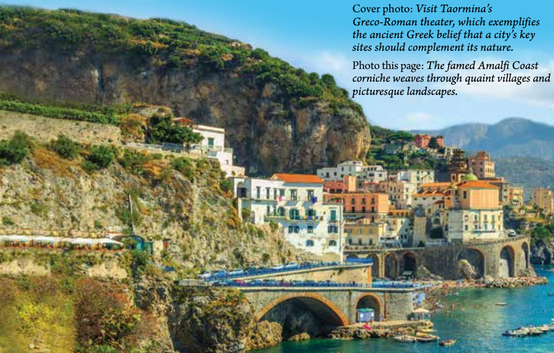
Photo this page: The famed Amalfi Coast cornice weaves through quaint villages and picturesque landscapes.

Cover photo: Visit Taormina's Greco-Roman theater, which exemplifies the ancient Greek belief that a city's key sites should complement its nature.