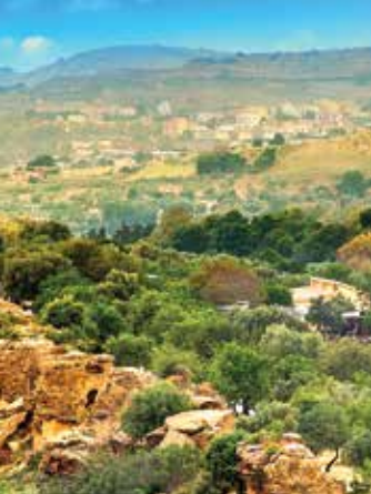
... built between 440 and 430 B.C., and harmony of Classic Doric style.