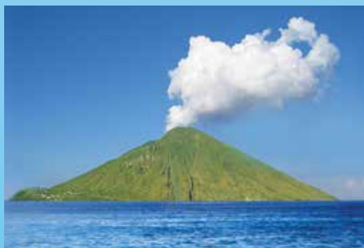
Admire the symmetrical cone and primordial beauty of Stromboli, a picture-perfect volcano.

Stroll along Taormina's distinctively Mediterranean pedestrian thoroughfare, Corso Umberto.