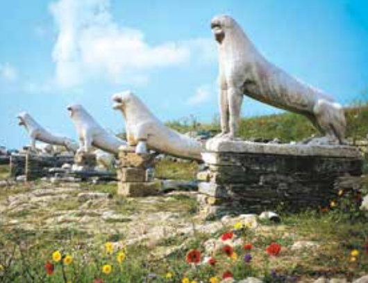
See Delos's famed Terrace of the Lions, dedicated to Apollo before 600 B.C.

RESPONSIBILITY: Gohagan & Company, the sponsoring associations/organizations, and its and their employees, shareholders, subsidiaries, affiliates, officers, directors or trustees, successors, and assigns (collectively "Gohagan"), do not own or operate any entity which is to or does provide goods or services for your program including, for example, lodging facilities, airline, vessel, or other transportation companies, guides or guide services, local ground operators, providers or organizers of optional excursions, food service or entertainment providers, etc. All such persons and entities are independent contractors. As a result, Gohagan is not liable for any negligent or willful act or failure to act of any such person or entity or of any other third party.