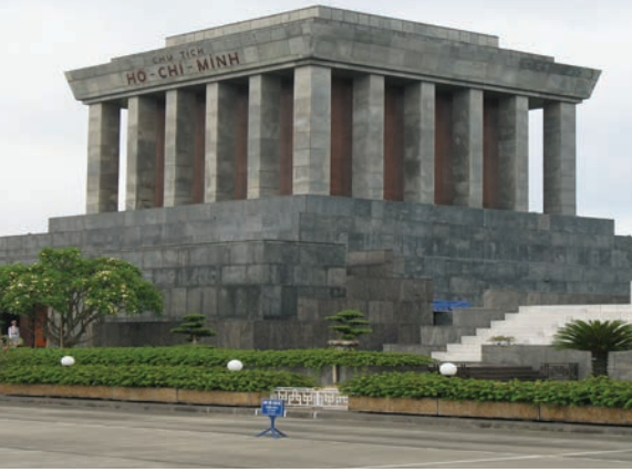
Ho Chi Minh Mausoleum