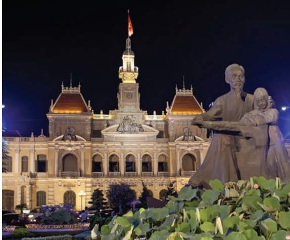
Ho Chi Minh City Hall