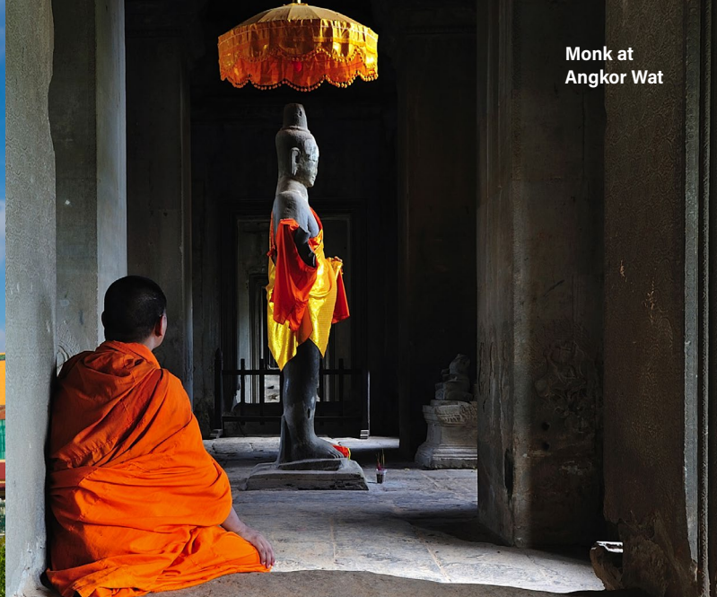
Monk at Angkor Wat