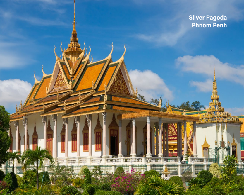
Silver Pagoda Phnom Penh