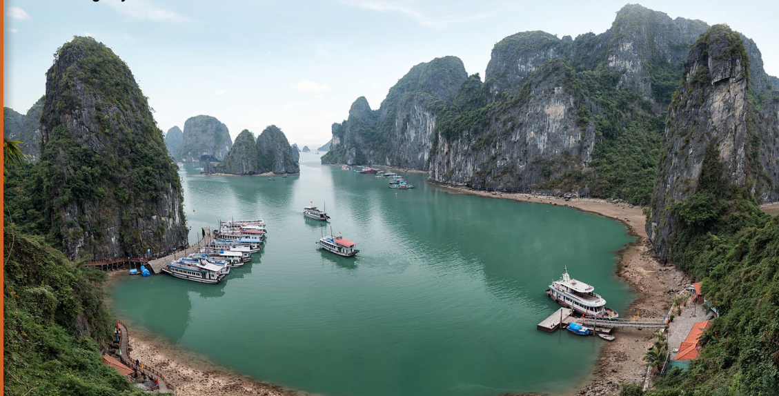
Ha Long Bay