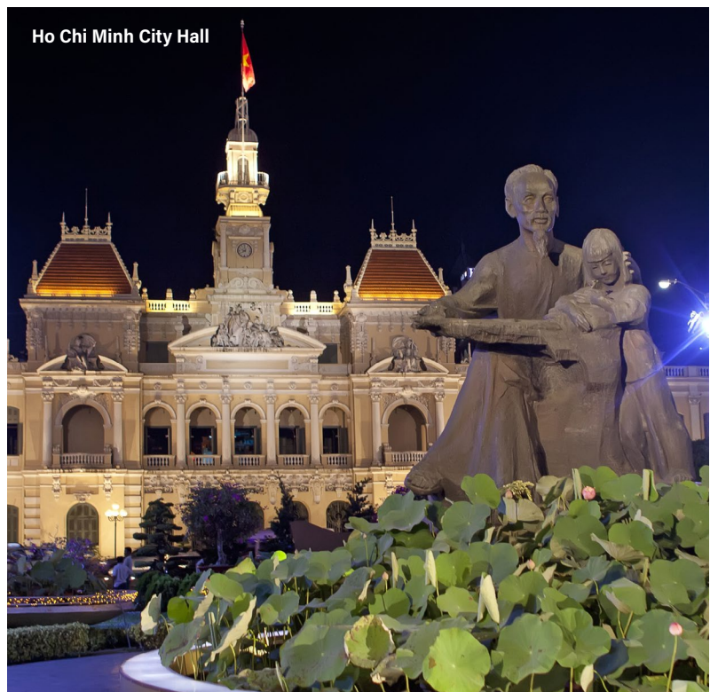
Ho Chi Minh City Hall

Visit a traditional sampan -making village on Gieng Island to observe skilled craftsmen at work. Travel along rural canals, then explore a historic Franciscan monastery. In Hong Ngu, visit a vibrant women's weaving cooperative and a colorful temple dedicated to the Hoa Hao faith. Later in the day, cruise across the border into Cambodia as your journey continues upstream. MEKONG PRINCESS (B,L,D)