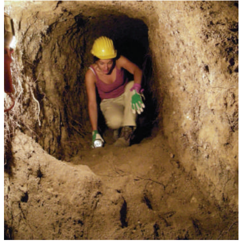
Archaeologist exploring a tunnel in a tomb.