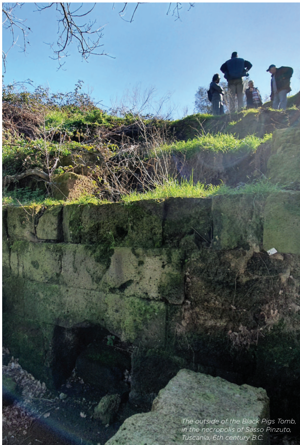
The outside of the Black Pigs Tomb, in the necropolis of Sasso Pinzuto, Tuscany, 6th century B.C.