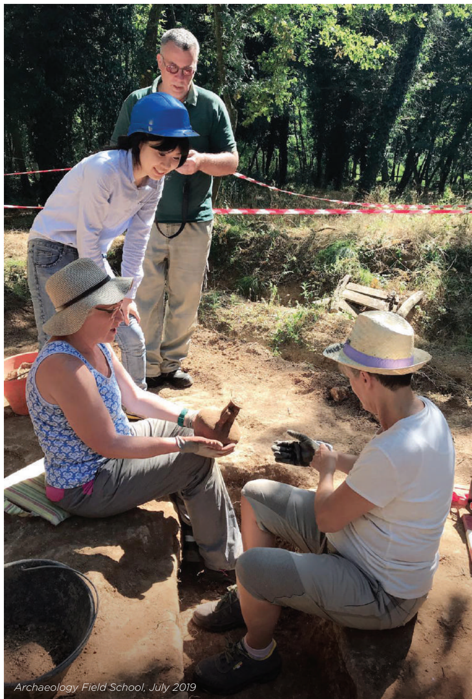
Archaeology Field School, July 2019