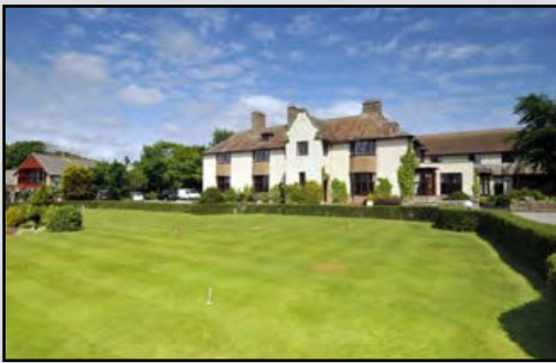
Three nights at the 4-star Royal Marine Hotel in Brora