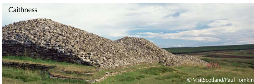
Cover: (top) Callanish Standing Stones, (bottom, clockwise from top center) Little Assynt, a puffin on Handa Island, a Highland cow, Dun Carloway, staircase inside Dun Carloway.

Scotland's long and varied history stretches back many thousands of years, and archaeological remains ranging from Neolithic cairns and stone circles to Iron Age brochs (ancient dry stone buildings unique to Scotland), medieval castles, and deserted clearance villages cover these landscapes. Seven of our touring days involve hikes of 4.5 to 6 miles per day, and we will rest and reflect in comfortable hotels that extend Highland warmth and hospitality.