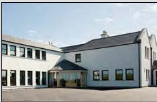
Three nights at the 4-star Borve Country House Hotel in Borve