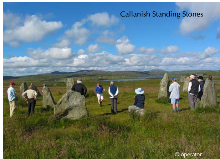
Callanish Standing Stones

In the morning we travel to Stornoway for a one-hour group flight to Glasgow International Airport (GLA), to connect with independent flights homeward. (B)