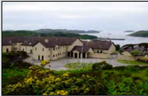
Three nights at the 5-star Inver Lodge Hotel in Lochinver