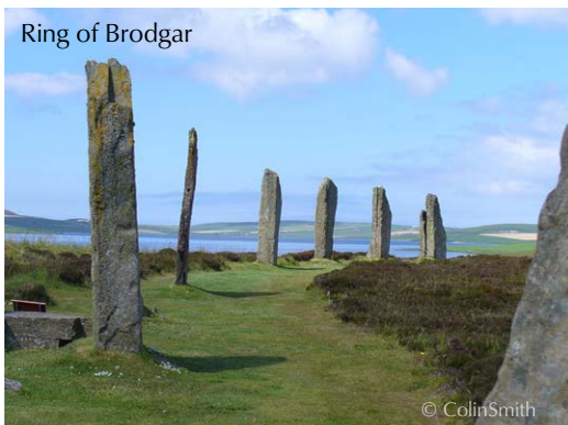
Ring of Brodgar