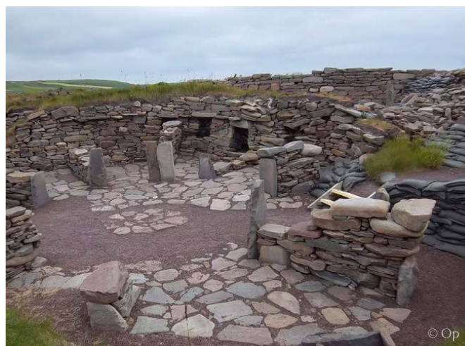
Above: Old Scatness on south mainland, Shetland Below: Hermaness, Isle of Unst