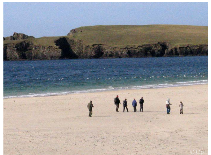
AIA travelers on the tombolo to St. Ninian's Isle

This morning we will check out of our hotel and travel south for a visit to Jarlshof, an archaeological site that was occupied for more than 4,000 years. There is a remarkable sequence of stone structures: late Neolithic houses, a Bronze Age village, an Iron Age broch and wheelhouses, a Norse longhouse, a medieval farmstead, and a 16 th -century laird's house. Our next stop is St. Ninian's Isle, which is connected to the mainland by a tombolo (a bar of sand, or shingle). St. Ninian's was settled in pre-Norse times, and the remains of an old chapel are still visible. We will walk across the tombolo and visit the site of the chapel. Back on mainland we will drive to Lerwick. You will have some free time to explore its shops, and the excellent Shetland Museum & Archives, before we take the overnight ferry to Aberdeen at about 5:30pm. We will have dinner aboard the ferry. (B,L,D)