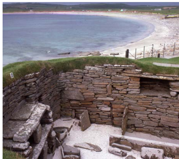
Above: Skara Brae, a late Neolithic settlement. Below: The Ring of Brodgar, a stone circle that is 341 ft. in diameter, is the third largest in the British Isles.