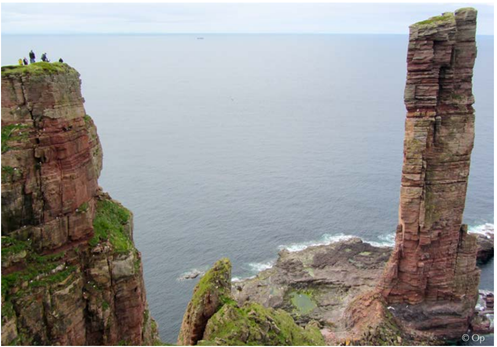
The Old Man of Hoy stands 450 ft. high in the Orkney Islands.