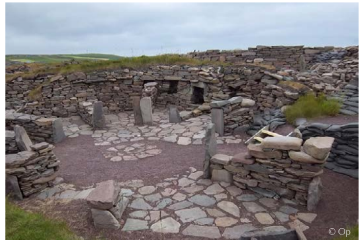
Above: Old Scatness on south mainland, Shetland Below: Hermaness, Isle of Unst