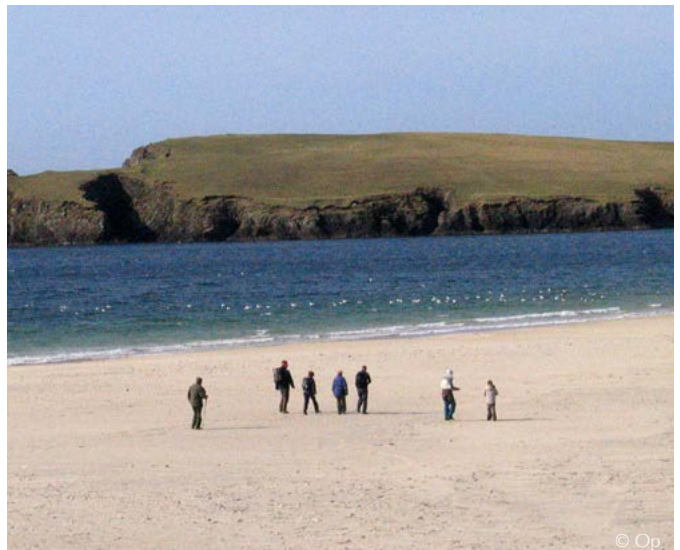
Travelers on the tombolo to St. Ninian's Isle.

This morning we will check out of our hotel and travel south for a visit to Jarlshof, an archaeological site that was occupied for more than 4,000 years. There is a remarkable sequence of stone structures: late Neolithic houses, a Bronze Age village, an Iron Age broch and wheelhouses, a Norse longhouse, a medieval farmstead, and a 16 th -century laird's house. Our next stop is St. Ninian's Isle, which is connected to the mainland by a tombolo (a bar of sand, or shingle). St. Ninian's was settled in pre-Norse times, and the remains of an old chapel are still visible. We will walk across the tombolo and visit the site of the chapel. Back on mainland we will drive to Lerwick. You will have some free time to explore Lerwick, its shops, and the excellent Shetland Museum & Archives, before we take the overnight ferry to Aberdeen at about 5:30pm. We will have dinner aboard the ferry. (B,L,D)