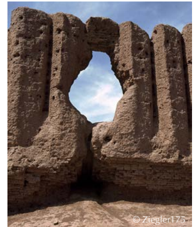
Left, Anau, Turkmenistan. Above, Merv, Turkmenistan