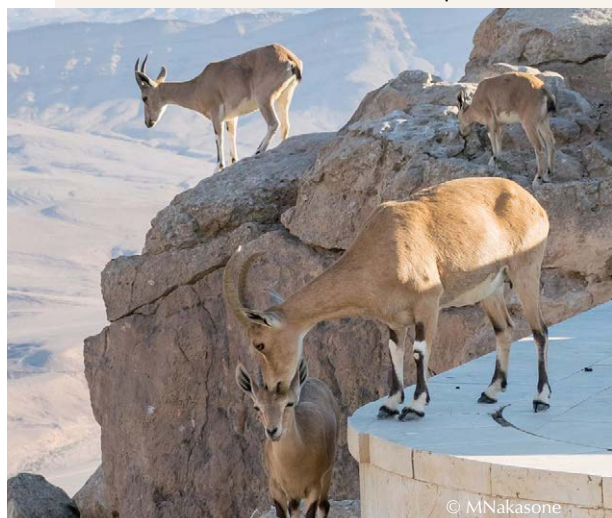
Ibex at Mitzpe Ramon

Airfare from/to home is not included. Individual VIP transfers on arrival to, and a group transfer for departure from, Ben Gurion Airport (TLV) will be provided on program dates. Once you have received your final payment invoice from our office you should book your flights. If you are considering booking your flights before this time, please contact our office first. Your flight itinerary must be provided to our office prior to departure. We do not accept liability for cancellation penalties related to domestic or international airline tickets.