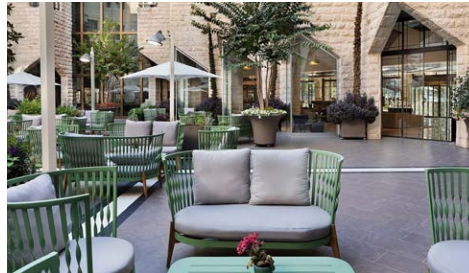
Jerusalem: Four nights at the 5-star Inbal Jerusalem Hotel