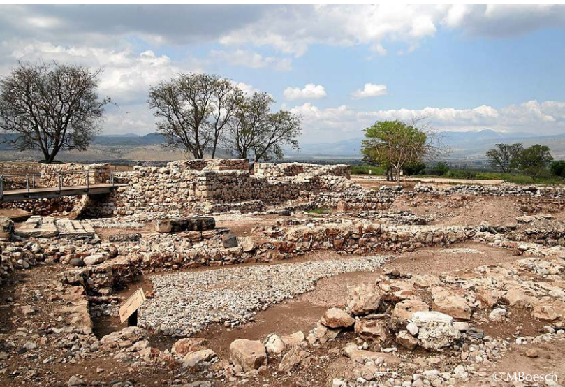
The UNESCO World Heritage Site of Hazor, which was home to the area's largest fortified settlement in both the 18 th and 9 th centuries B.C.