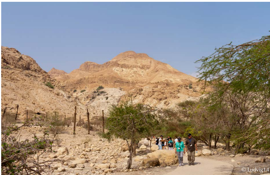
Ein Gedi National Park

the Byzantine period, it has been destroyed and rebuilt several times, most recently by Greek monks at the end of the 19 th century. We make one other stop on our drive to Jerusalem, at the Museum (Inn) of the Good Samaritan, an indoor/outdoor museum of ancient mosaics, some of which date to the 4 th century A.D. Enjoy dinner together in Jerusalem. Overnight at the 5-star Inbal Jerusalem Hotel (deluxe rooms) for four nights. (B,L,D)