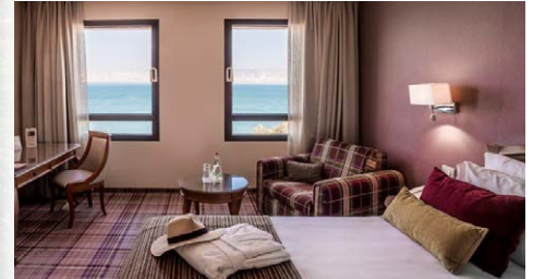
Tiberias: Four nights at the 5-star Scots Hotel