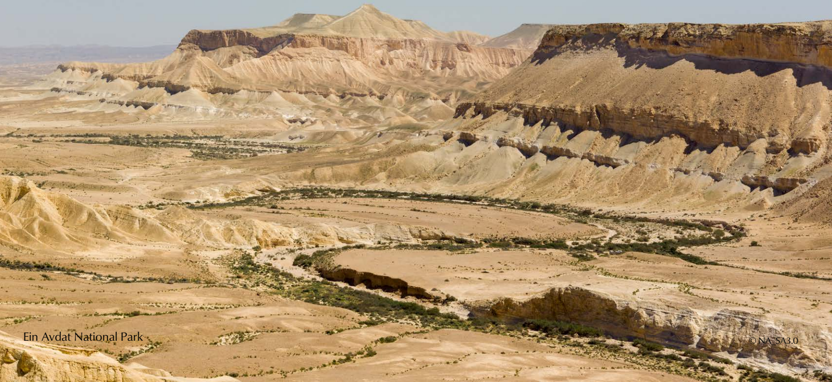
Ein Avdat National Park