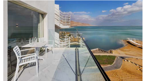
Ein Boqueq: One night at the 4.5-star Herbert Samuel Hod Dead Sea Hotel