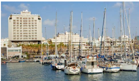
Tel Aviv: One night at the 5-star Carlton Tel Aviv hotel