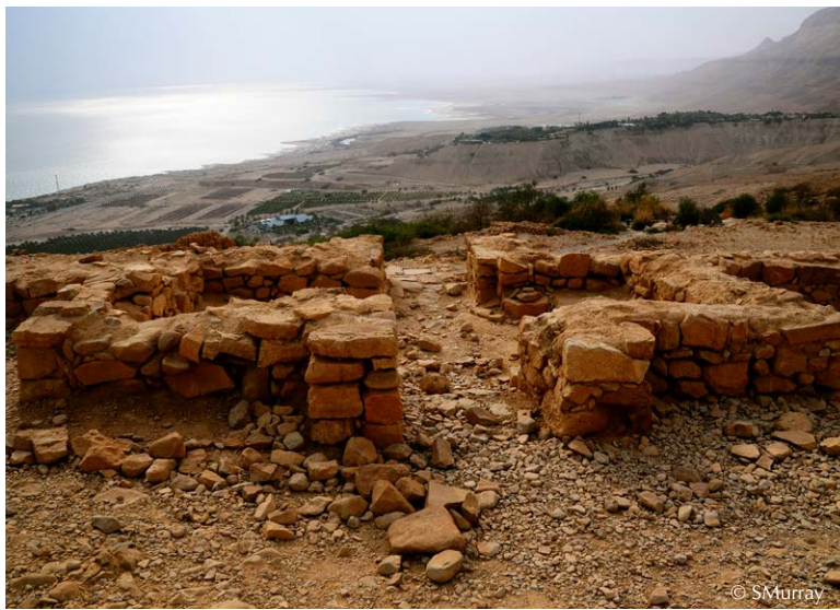
Chalcolithic (Copper Age) site overlooking the oasis of Ein Gedi National Park, where we hike on May 14 th .