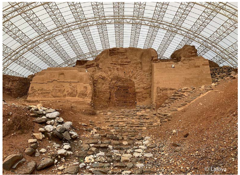
Take a walk through Tel Dan Nature Reserve, with the remains of a 5,000-year-old city.