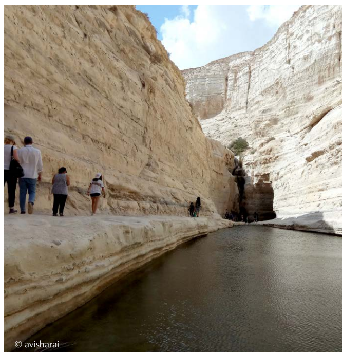
Ein Avdat National Park

This morning, we leave the city behind and head to the lush oasis of Ein Gedi. We hike through this national park, seeking the resident ibex and birds of prey. Walk along the sparkling Nahal David, or David's stream; visit the Chalcolithic temple overlooking the oasis; and see an excavated ancient synagogue with a perfectly preserved mosaic floor featuring a central square of exotic birds surrounded by a precise pattern of intersecting circles. After the hike we continue on to our hotel in Ein Boqeq, on the Dead Sea, and then gather for dinner. Overnight at the 4.5-star Herbert Samuel Hod Dead Sea Hotel (superior sea view rooms). (B,L,D)