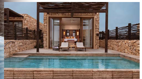
Mitzpe Ramon: Two nights at the 5-star Beresheet Hotel