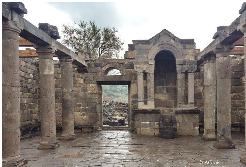
The ancient synagogue at Umm el-Kanatir, also known as Ein Keshatot, which was destroyed by an earthquake in the 8 th century and restored in the 21 st .