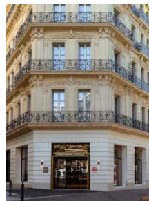
Marseille: One night at the 4-star Hôtel Mercure Marseille Canebière Vieux-Port