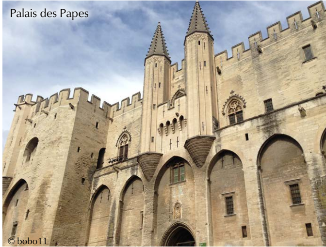
Palais des Papes

Archaeological Institute of America Tours P.O. Box 938, 47 Main Street, Suite 1, Walpole, NH 03608-0938