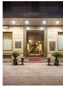
Turin: Two nights at the 5-star Grand Hotel Sitea