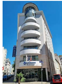
Lyon: Two nights at the 4-star Best Western Hôtel du Pont Wilson