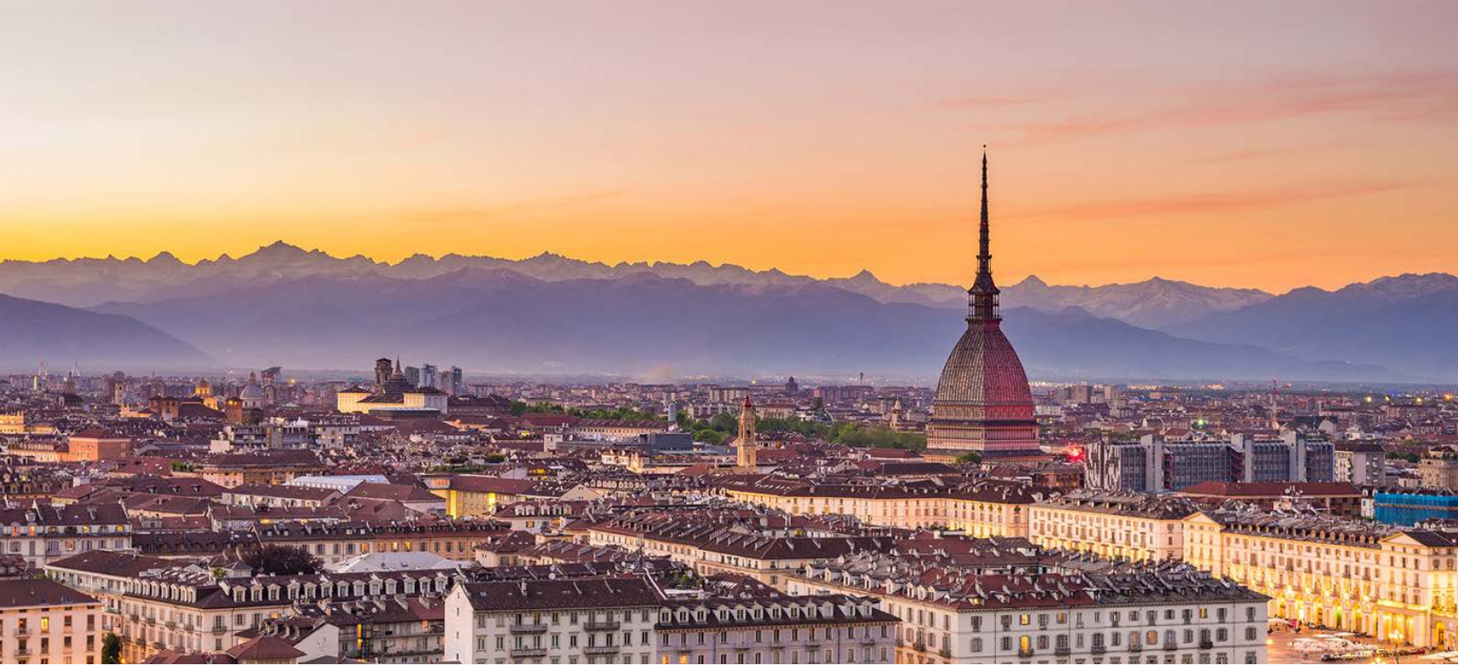
Turin, Italy, at sunset