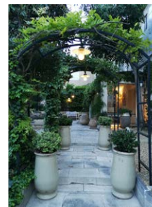
L'Isle-sur-la-Sorgue: Three nights at the 4-star Grand Hôtel Henri