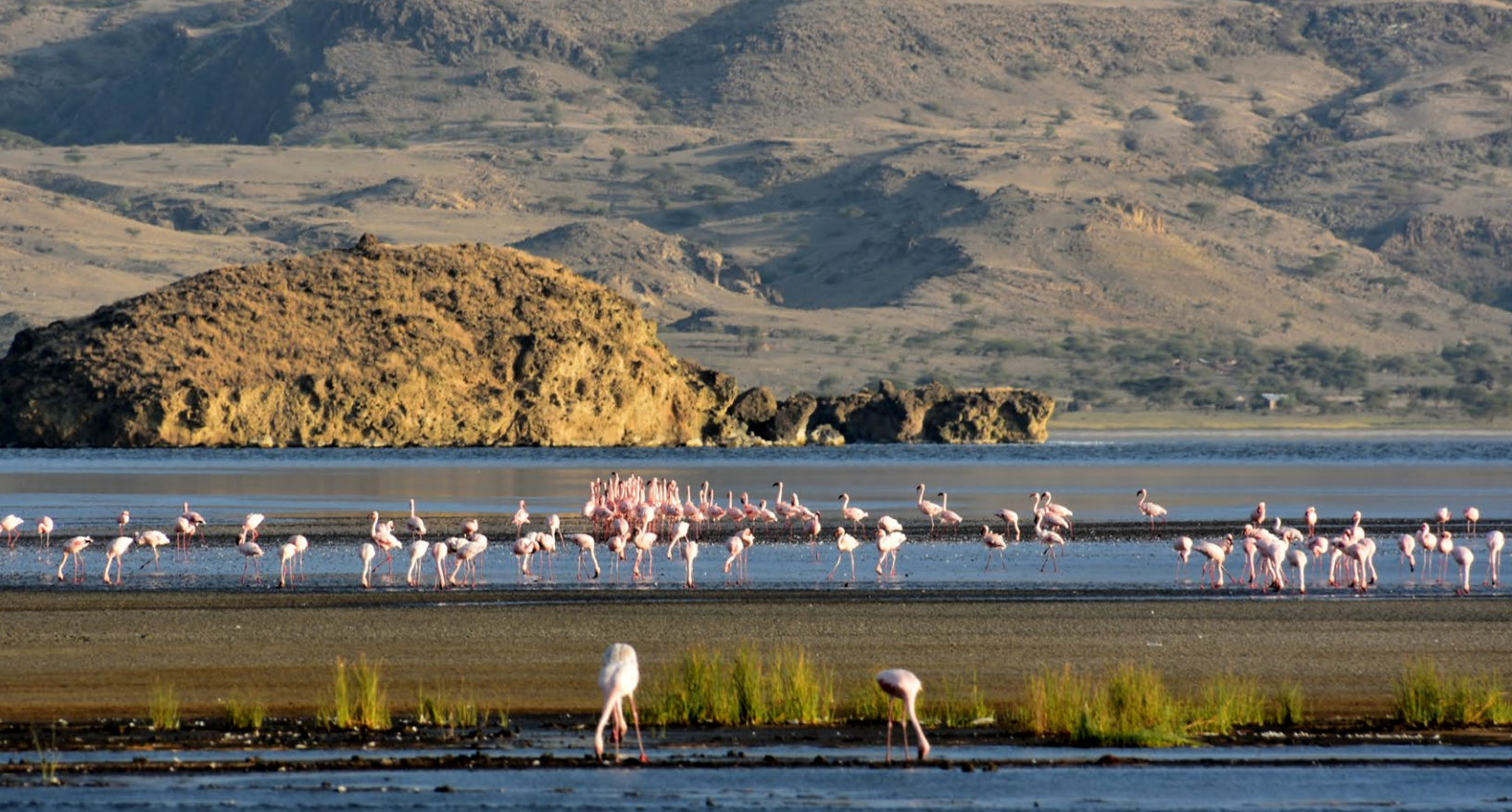
Flamingos at Lake Natron