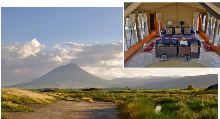
Lake Natron - Two nights at the 4-star Lake Natron Camp