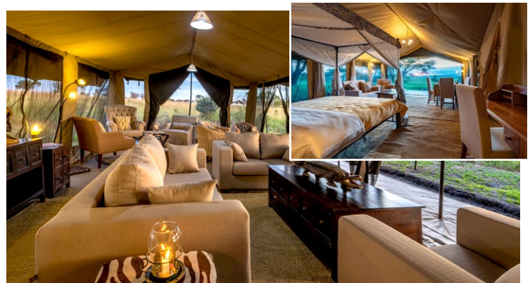
Northern Serengeti - Three nights at the 4-star Karibu Serengeti River Camp