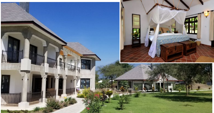
Arusha - Two nights and one day room at the 5-star Country Inn & Resort