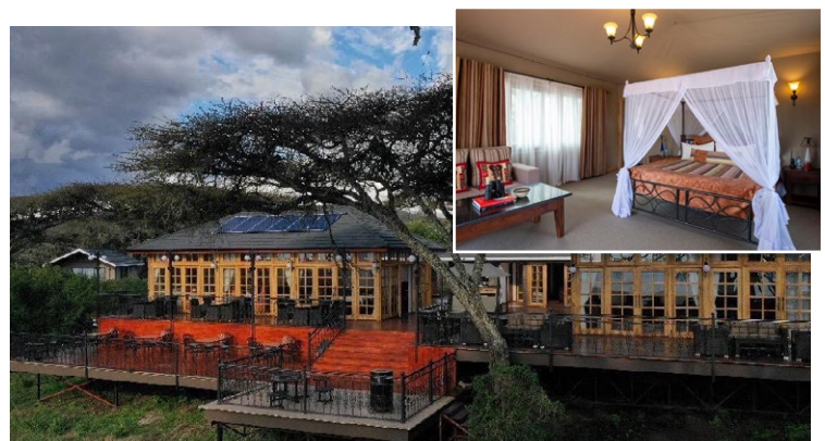
Ngorongoro Crater - Three nights at the 5-star Ngorongoro Lion's Paw Camp