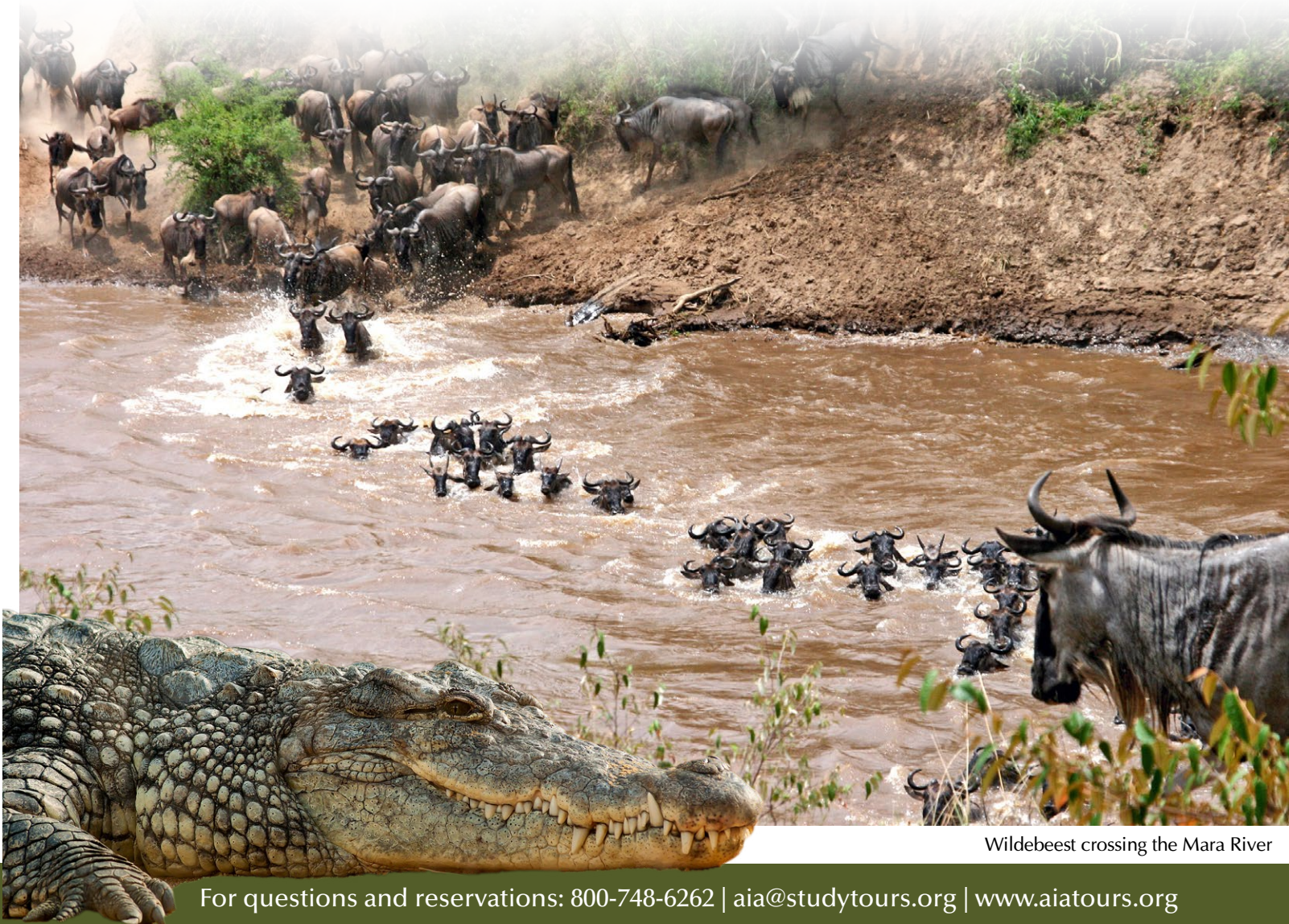
Wildebeest crossing the Mara River

Throughout our adventure you will enjoy generous comfort and exceptional service at several charming lodges and memorable safari camps . Camping (in great comfort) near the herds and away from the tourist lodges will leave you with unforgettable memories. All of our game drives will be led by expert driver-guides, and we will enjoy extra room for gear and to move about with no more than four guests per six-seater, stretch Land Rover and Land Cruiser , specially adapted for photography and unrestricted game viewing. Journeying through the impressive wildlife, beauty, and diversity of this African terrain highlights the privilege of exploring and learning from the world around us.