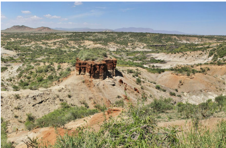
Olduvai Gorge, site of hominin fossil discoveries

After breakfast we drive back to Arusha, stopping along the way at the Cultural Heritage Center for lunch and some shopping. Continue to The Country Inn & Resort where you have a day room with time to relax, shower, and pack. Transfer to Kilimanjaro International Airport (JRO) in time for homeward flights that depart on the 16 th , and arrive in the U.S. the next day. (B,L,D on July 16 th )