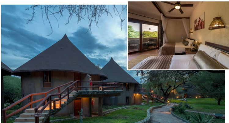
Tarangire - Three nights at the 3-star Tarangire Sopa Lodge