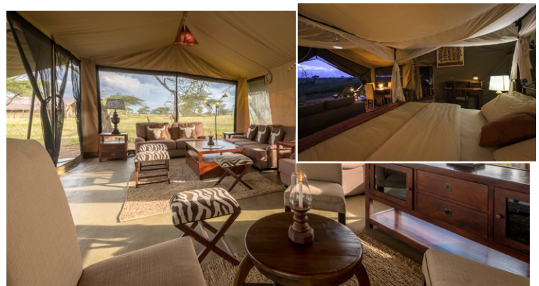
Central Serengeti - Two nights at the 5-star Karibu Serengeti Sametu Camp