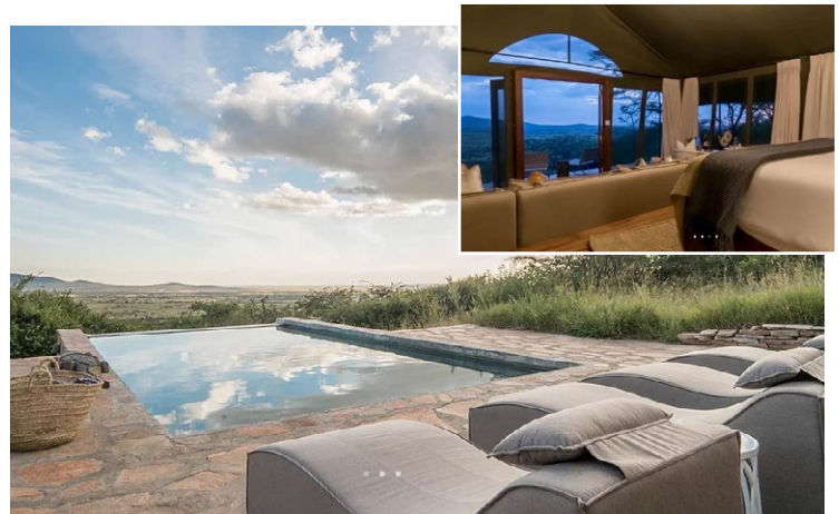
Loliondo - One night at the 5-star TAASA Lodge