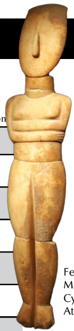
Female figurine 5, Museum of Cycladic Art, Athens