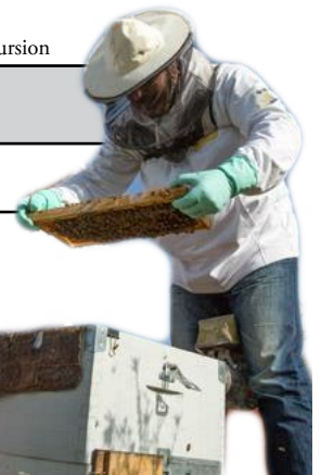
Bee Keeper, Honey & Ouzo Tasting

Prices are based on the number of participants on an individual excursion, not the total number in the overall group.