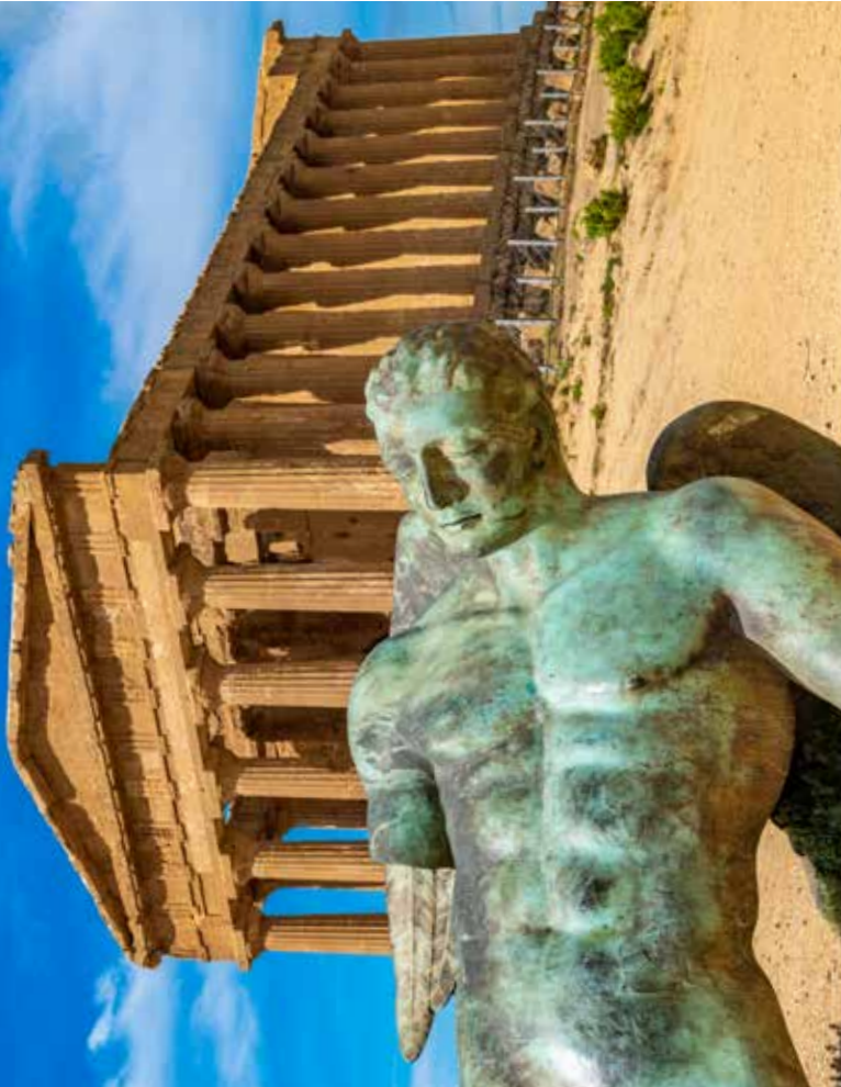
Temple of Concordia and bronze Icarus statue