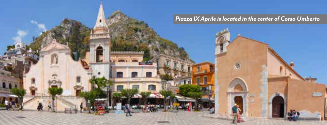
Piazza IX Aprile is located in the center of Corso Umberto

Dionysius' Ear; the Roman Amphitheater; and the Greek Theater. Transfer to the island of Ortygia, Syracuse's maritime heart, where the Temple of Apollo stands in the remains of Piazza Pancali.