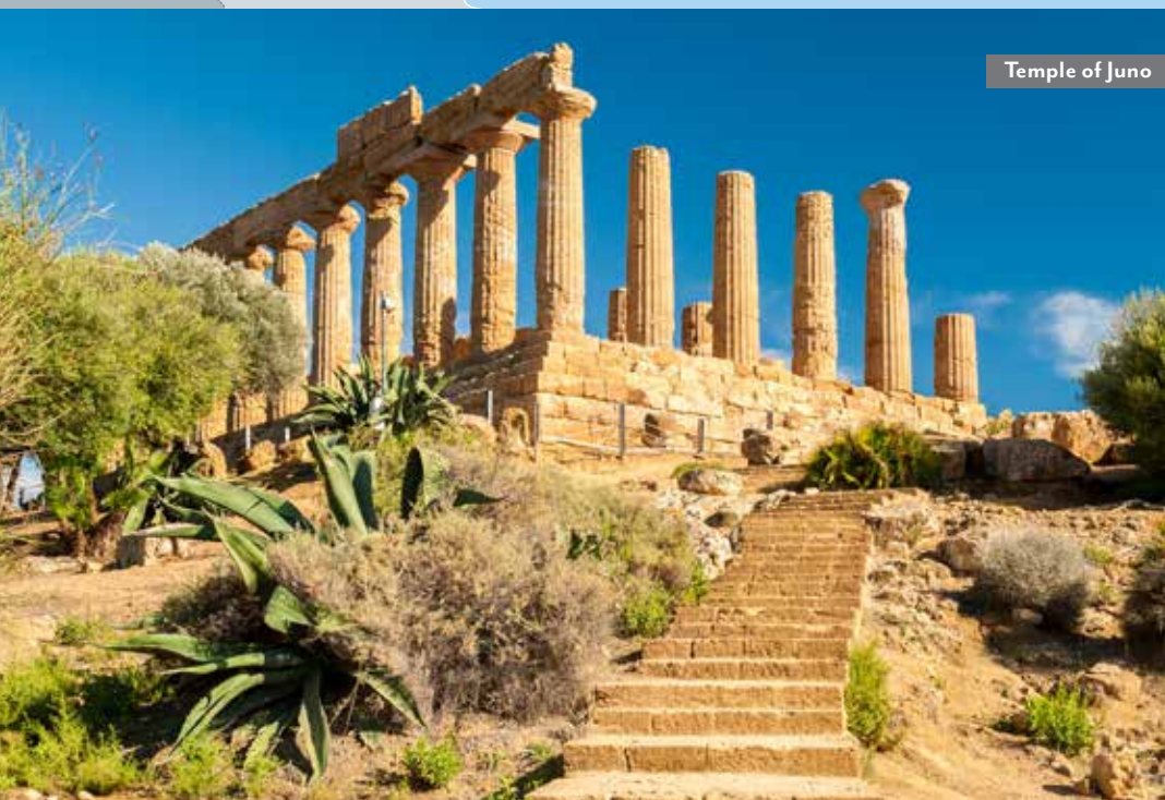
Temple of Juno