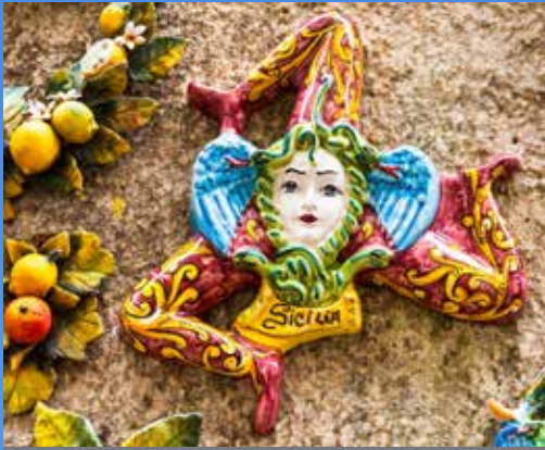
Ceramics showing Trinacria, the symbol of Sicily