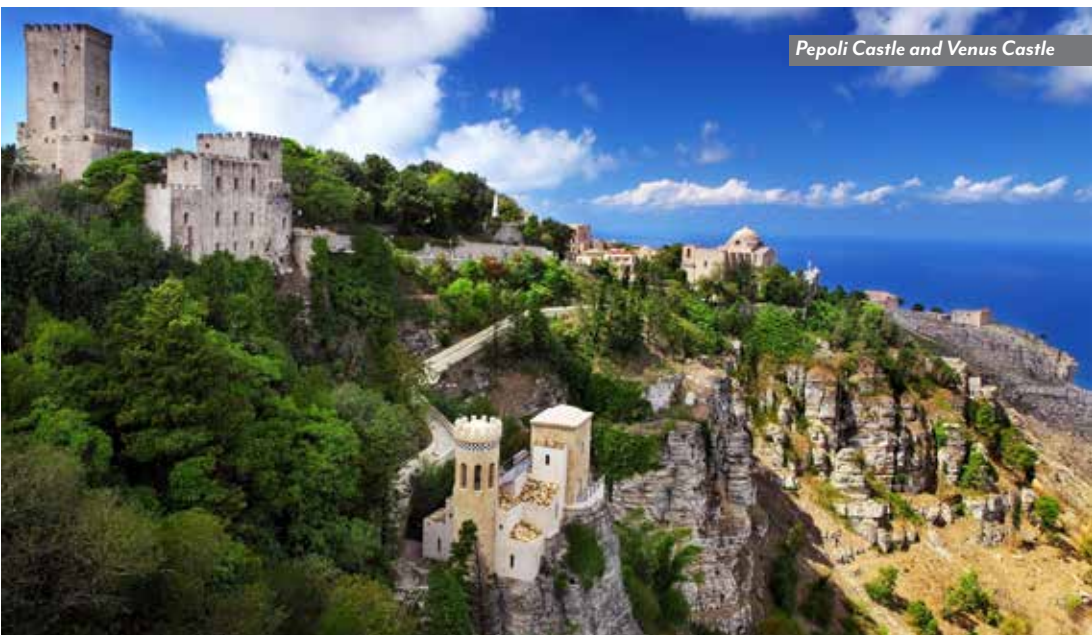
Pepoli Castle and Venus Castle

Transfer to the airport for your return flight home.