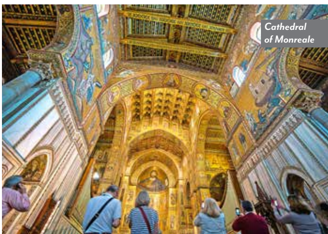
Cathedral of Monreale

Cruise through the Strait of Messina before arriving in Reggio Calabria to visit the