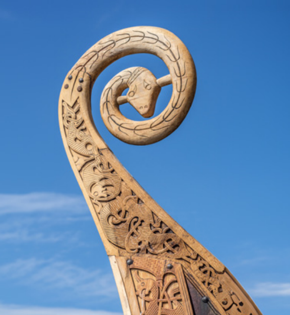
Viking Ship Wood Carving

including puffins, followed by a visit to beautiful Ålesund. Known for its Art Nouveau buildings and islands stretching out into the ocean, Ålesund offers three optional excursions including: 1) The medieval village of Sunnmøre, an open-air museum; 2) Viking's Island; or 3) An in-depth city walk including Mt. Aksla, followed by free time. In the afternoon, enjoy cruising with time for lectures. Spend the afternoon at sea, relaxing on board and keeping an eye out for whales.