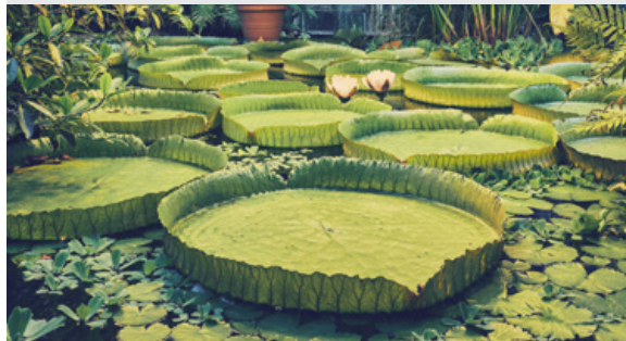
Giant Water Lilies—Oslo Botanical Garden, Norway

Further details and pricing will be sent to confirmed participants.