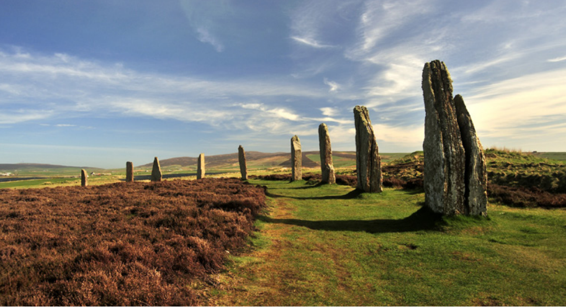
Ring of Brodgar