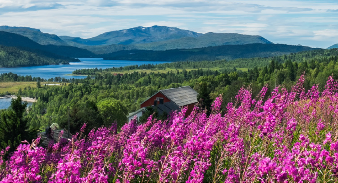
Flowers of Norway