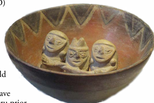
Pre-Hispanic Pottery (Larco Museum, Lima)