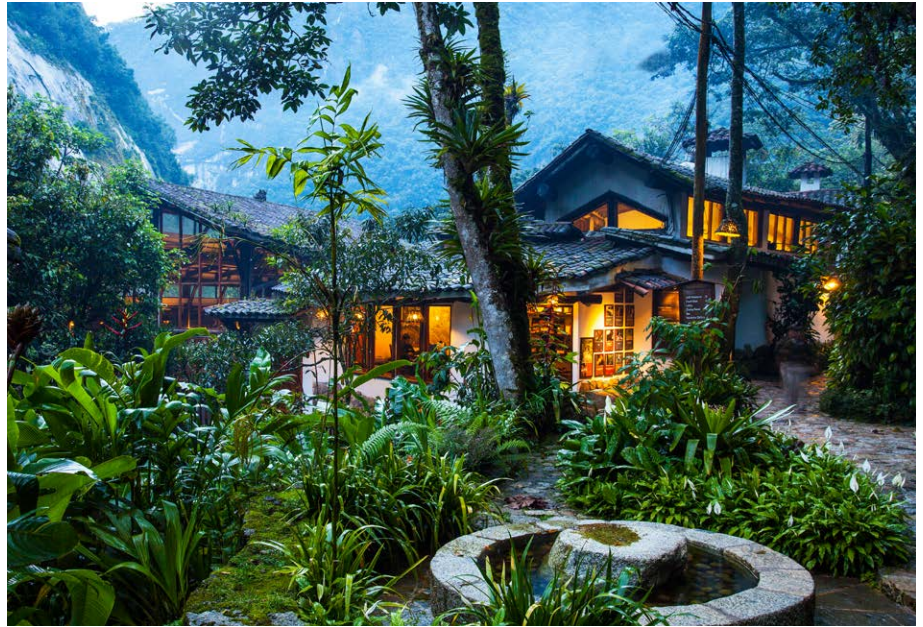
Inkaterra Machu Picchu Pueblo Hotel

The high altitude of Cuzco (11,150 feet) could cause problems for travelers with certain health conditions. Average temperatures in September range from the mid- to upper 60s F during the day to the mid-50s F at night. Complete pre-departure details will be sent to participants.