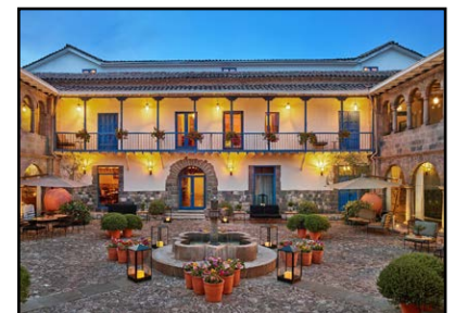
Cuzco: Three nights at the 5-star Palacio del Inka