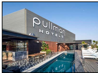
Lima: Two nights at the 5-star Pullman Lima Miraflores Hotel