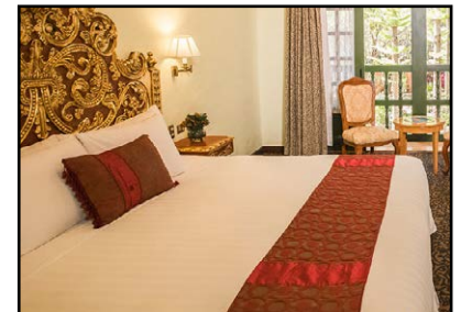
Urubamba: Three nights at the 5-star Aranwa Sacred Valley Hotel and Wellness