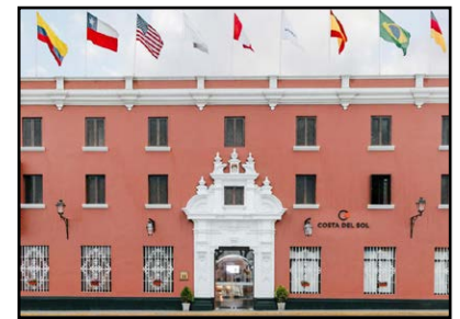
Trujillo: Two nights at the 4-star Hotel Costa del Sol Trujillo Center